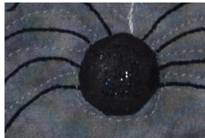
A Finished Stuffed Circle