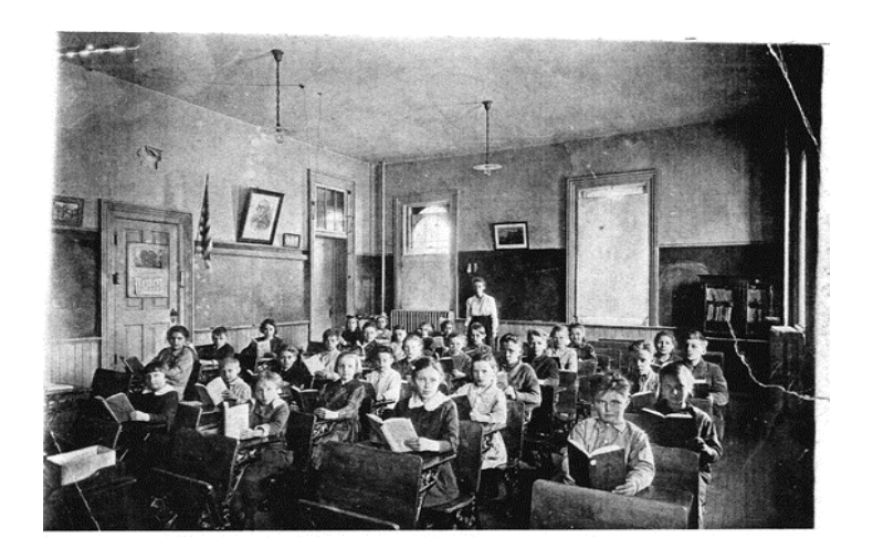
Figure 4: Huntley Consolidated School, ca. 1920; courtesy of the McHenry County Historical Society.

Superintendent Blair also used his 1920 report to again promote school consolidation as a path to school improvement. In fact, approximately 20 percent of the report was used to advance the subject. The thrust was to explain the process (i.e., how school districts and communities could effect mergers) and then to show successful examples, complete with photographs of beautiful new buildings and engaged students. Blair again stated the advantages of consolidation: "The consolidated school lends itself more readily to . . . progress. There are more teachers, more pupils, more parents interested in the school and in the community life," he wrote. . . . "There is more 'life,' hence, a greater interest in an improved life. When such interest is aroused, progressive, forward looking ideas and purposes are more readily and kindly received." "