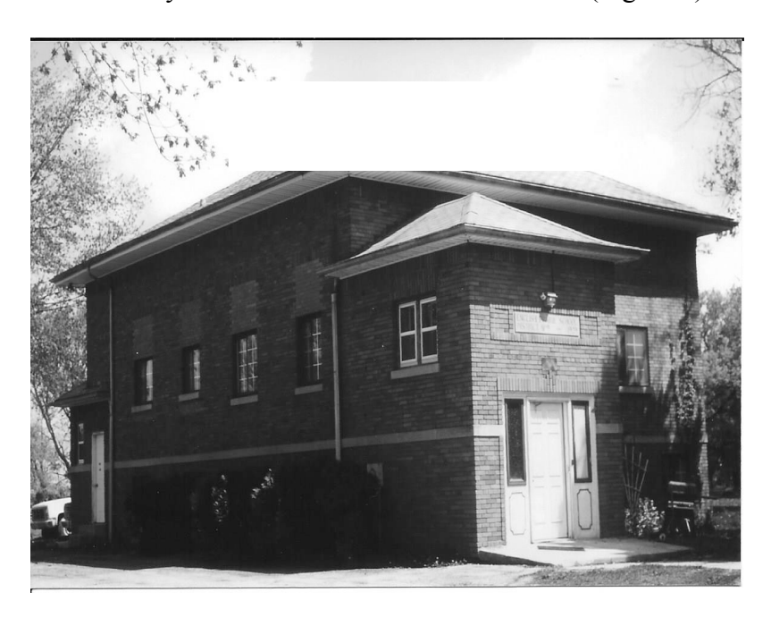
Figure 5: English Prairie School, near Spring Grove, Illinois, 1929; courtesy of McHenry County Historical Society

rural districts in McHenry County plus several more in neighboring Kane County combined with Huntley to form Huntley Consolidated School District #158 (Figure 4).<sup>80</sup>