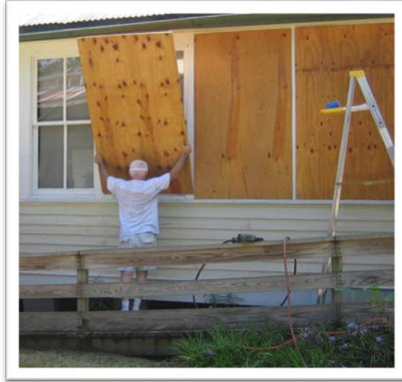
Figure 2: Richard boarding up the windows of the schoolhouse before Harvey made landfall.