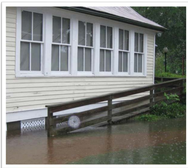
Figure 3: Water went half way up the foundation blocks and handicapped ramp but did not get inside the schoolhouse or outhouse during and after Harvey.