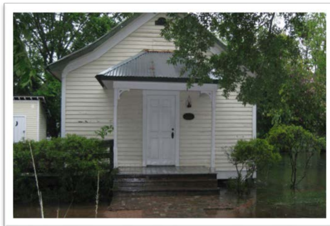
Figure 4: The sidewalk in front of the school after a night of rain from Harvey.

Standing water resulted from Harvey. The picture of the schoolhouse was taken in the morning after Harvey struck. Water reached the highest point during the night but by morning was beginning to recede. So the picture with the sidewalk showing (Figure 4) was probably under water during the night, but water never got into the schoolhouse.