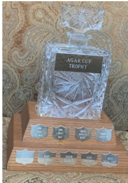
The Agar Cup Trophy - 2021