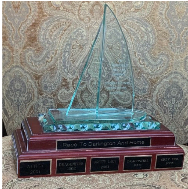
The Vanguard Trophy - 2021