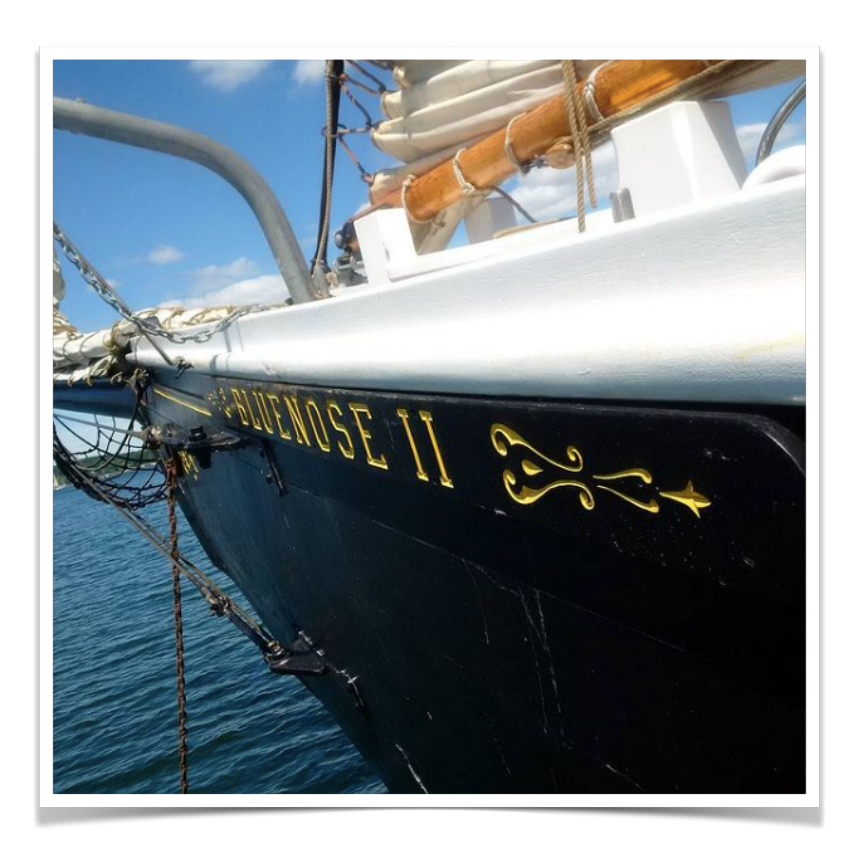
A picture I took after we anchored in Mahone Bay for lunch on the Bluenose II

Friday Night September 28th, 8 PM Moonlight Cruise #6 and Anchor Out in Bondhead Bay