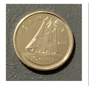
100 YEARS PAGE 6