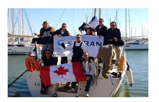
They can't all be leased on site

Whatever race or regatta you attend, keep in mind that it can be the journey, not just the destination!