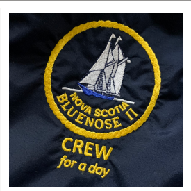
BLUENOSE II PAGE 8