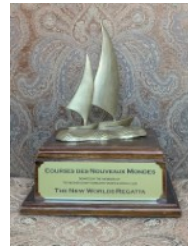
SAIL WEEKEND SEPTEMBER 11 & 12