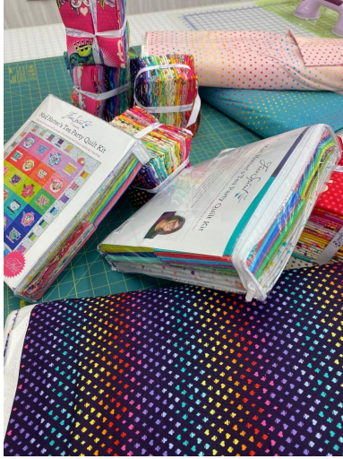
Curiouser & Curiouser by Tula Pink Kits, Fat Quarter Bundles, Yardage

Design Wall adds all new stock to the online shop within 24 hours of its arrival. It never stops coming & several new pieces have arrived that you may want to take a good look at before they sell out!