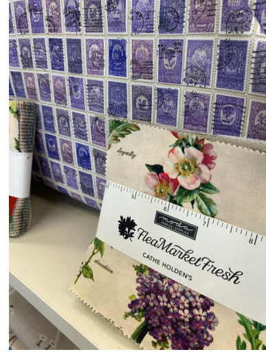
Flea Market Fresh for Moda Charm Packs & Yardage