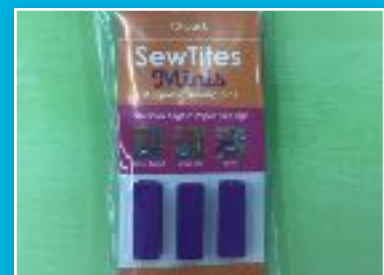
SewTites - magnetic pins perfect for English Paper-Piecing, holding multiple layers, and thick materials.