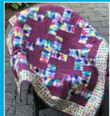
RJR - bright digital prints