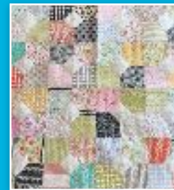
Jen Kingwell - Fine & Sunny available in pre-cuts and yardage

Beautiful new lines, RJR digital prints & new notions in now!