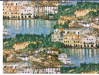
Robert Kaufman | Gustav Klimt