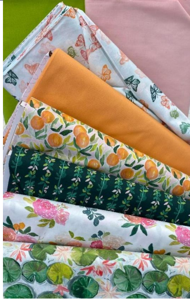
Dear Stella | Orangerie