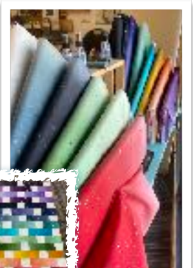
Fairy Dust Ombrés & Thread Count pattern