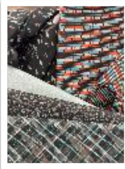
Moda's Tahoe Ski Weekend - is as feathery as the first snow