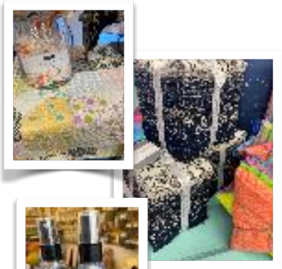
Never too early for gift ideas