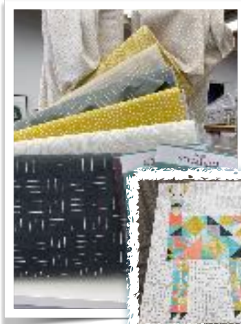
See the highly sought "No-drama Llama" in Moda's Ginger line.