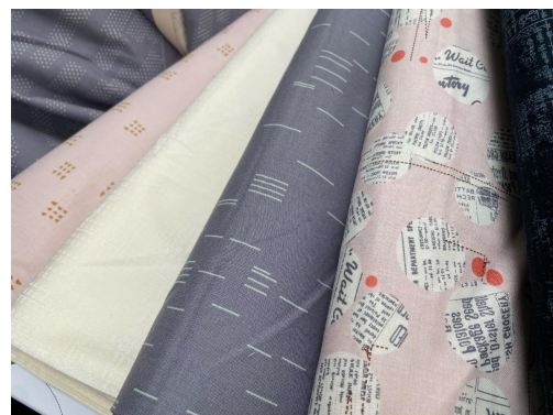
Zen Chic Celestial

This one is going FAST. This fabric has less than 2m remaining