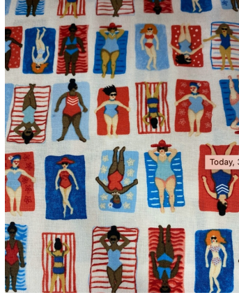
Dear Stella Life's A Beach