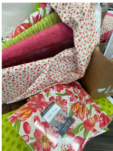
Robin Pickens Tulip Tango

Patterns are in stock and Jelly Rolls (for the JR Friendly pattern) are en route, as we speak