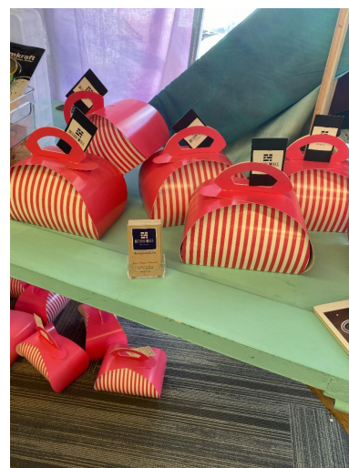
Mystery Scrap Boxes Generously Cut 1/2m & 1m Boxes

Paired with Manitoba's own Highway 10, this collection has been kitted into 60"x60" laps quilts. Yardage and layer cakes remain in stock - but they're going FAST!