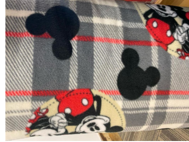
60" Fleece Mickey & Minnie

Plan ahead - winter does last about 9 months in Manitoba, right?