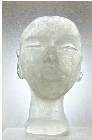
Sevin Fortier The ghosts of my predecessors 2024 Glass £400