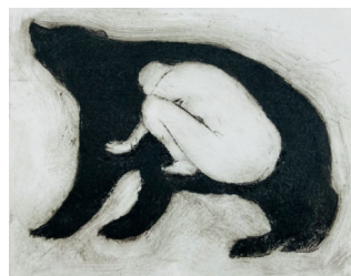
Theodora Boorman Untitled (Callisto) 2024 Copper plate drypoint Edition of 15 Cotton rag paper Image size 7 x 9cm £50 unframed