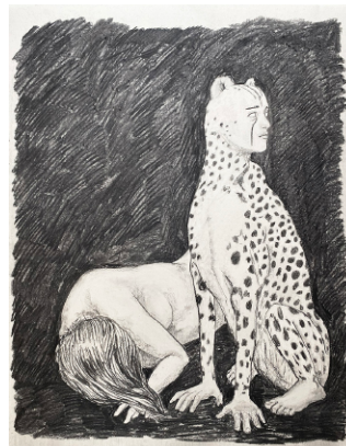
Sevin Fortier Guardian 2023 Charcoal on paper 59 x 84cm £600 framed