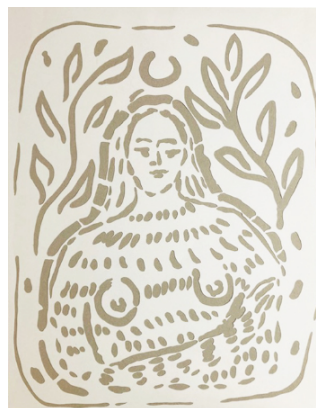
Theodora Boorman Woodwose 2024 Reclaimed paper stock 80 x 59.5cm £220