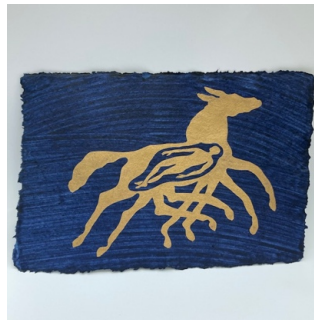
Theodora Boorman Untitled (I return) 2024 Relief print Edition of 25 Indigo painted cotton rag paper 24 x 36cm £60