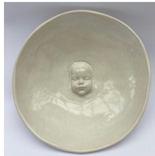
Theodora Boorman Drink to remember the faces of children long-since grown 2023 Stoneware 19.5 x 20 x 5.5cm £140