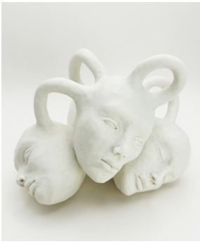
Sevin Fortier My father and I speak different languages 2024 Porcelain £700