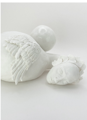
Sevin Fortier Unbeing III 2023 Porcelain £1200