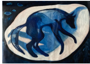
Theodora Boorman Do you know where you are going? 2024 Oil on unstretched cotton canvas 87 x 60.5cm £400