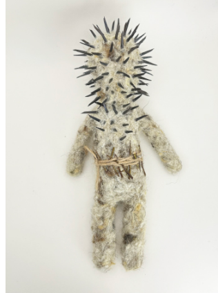
Sevin Fortier There, there, poppet 2024 Wool, nails, thorns, jute £400