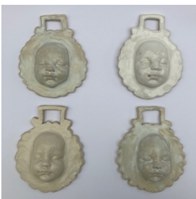
Theodora Boorman Cherub 2024 Installation of stoneware forms 7.5 x 9.5 x 2cm Available separately £45