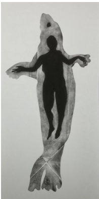
Theodora Boorman Second skin 2024 Tetrapak drypoint Edition of 5 Awagami Masa paper Image size 33 x 17cm £80 unframed