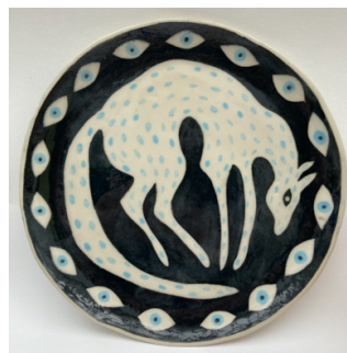
Theodora Boorman Blue-eyed fox 2023 Stoneware 24 x 24.5 x 2cm £95