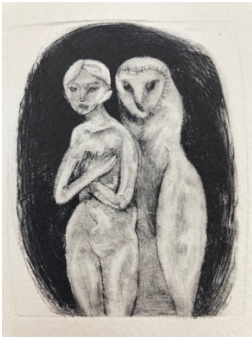
Theodora Boorman My mother knows my true face 2024 Copper plate drypoint Edition of 15 Cotton rag paper Image size 7 x 9cm £50 unframed £75 framed