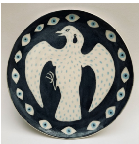
Theodora Boorman Bird with blue-bead earring 2023 Stoneware 23.5 x 23 x 2cm £95