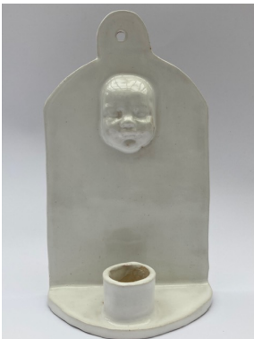
Theodora Boorman I have been made by many hands 2024 Installation of stoneware candle sconces 21.5 x 12 x 6cm Available separately £95