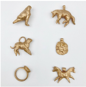
(Numbered L-R, top L to bottom R)