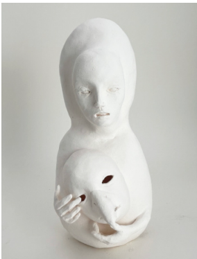
Sevin Fortier Untitled (Do not hide from me) 2024 Porcelain £500