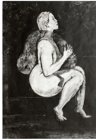
Sevin Fortier I carry your heart with me 2023 Monotype HoSho paper Image size 21 x 29.7cm £360, framed Limited edition of 25 giclée prints available £40