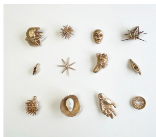
(Numbered L-R, top L to bottom R)