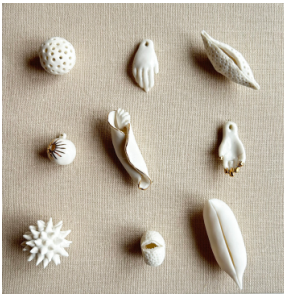
Sevin Fortier Keepsakes 2024 Porcelain, gold Various sizes Available separately £50 each