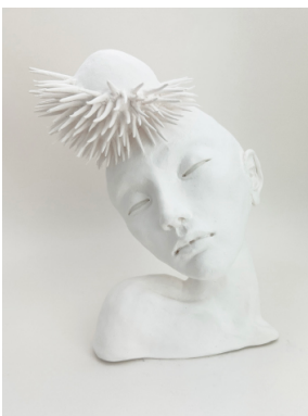
Sevin Fortier Longing 2024 Porcelain £600