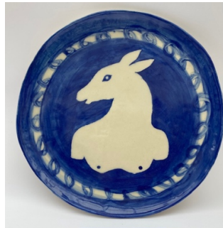
Theodora Boorman Fawn sister II 2023 Stoneware 24.5 x 24.5 x 2cm £95