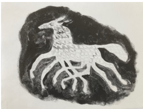
Theodora Boorman Untitled (Feathered horse) 2023 Monotype 1/1 Reclaimed paper stock Image size 23 x 19cm £120