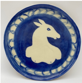
Theodora Boorman Fawn sister I 2023 Stoneware 24.5 x 24.5 x 2cm £95