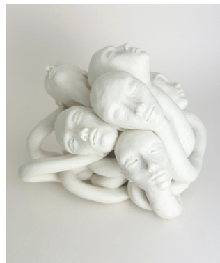
Sevin Fortier Hydra 2024 Porcelain £800