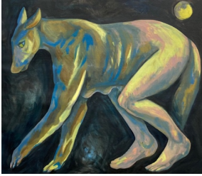
Theodora Boorman Inheritance 2024 Oil on cotton canvas 70 x 81cm, unframed £600