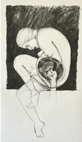
Sevin Fortier We are all mothers 2024 Charcoal on paper 92 x 150cm £600