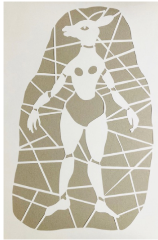
Theodora Boorman Make me anew 2024 Reclaimed paper stock 83.5 x 59.5cm £220