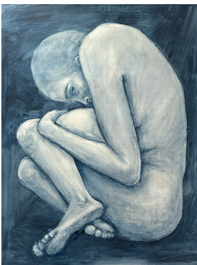
Sevin Fortier Hold tight 2024 Oil on canvas cm £800