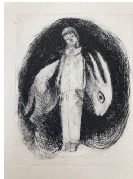
Theodora Boorman I met a gentleman with horns 2024 Copper plate drypoint Edition of 15 Cotton rag paper Image size 7 x 9cm £50 unframed £75 framed