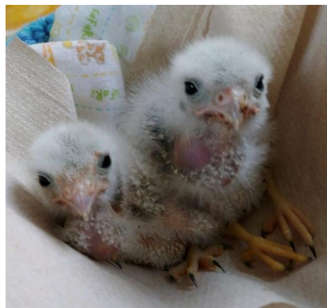
American Kestrel nestlings, approximately 12 days old

We admitted our first of 27 nestlings, a Great Horned Owl on February 26 and our last of 57 fledglings, a Mississippi Kite on July 18 making the 2020 baby season a long one. Nestlings are unable to take care of themselves and require hand-feeding or the care of a surrogate parent. We are fortunate to have a Great Horned Owl and two Kestrels who will act as surrogates. Fledglings are somewhat self-sufficient and will generally eat cut food on their own; they need to see and hear a member of their own species for normal development so we place them with adults of the same species.