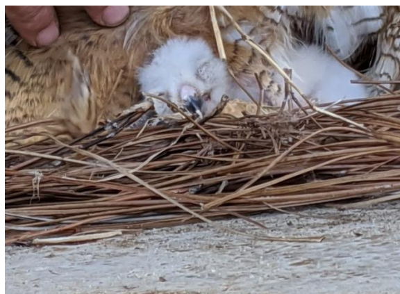
Newly-hatched Great Horned Owlet under Nonamé's wing