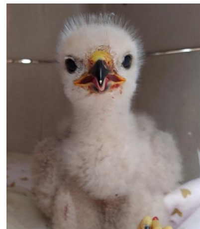
Red-shouldered Hawk nestling, approximately 25 days old