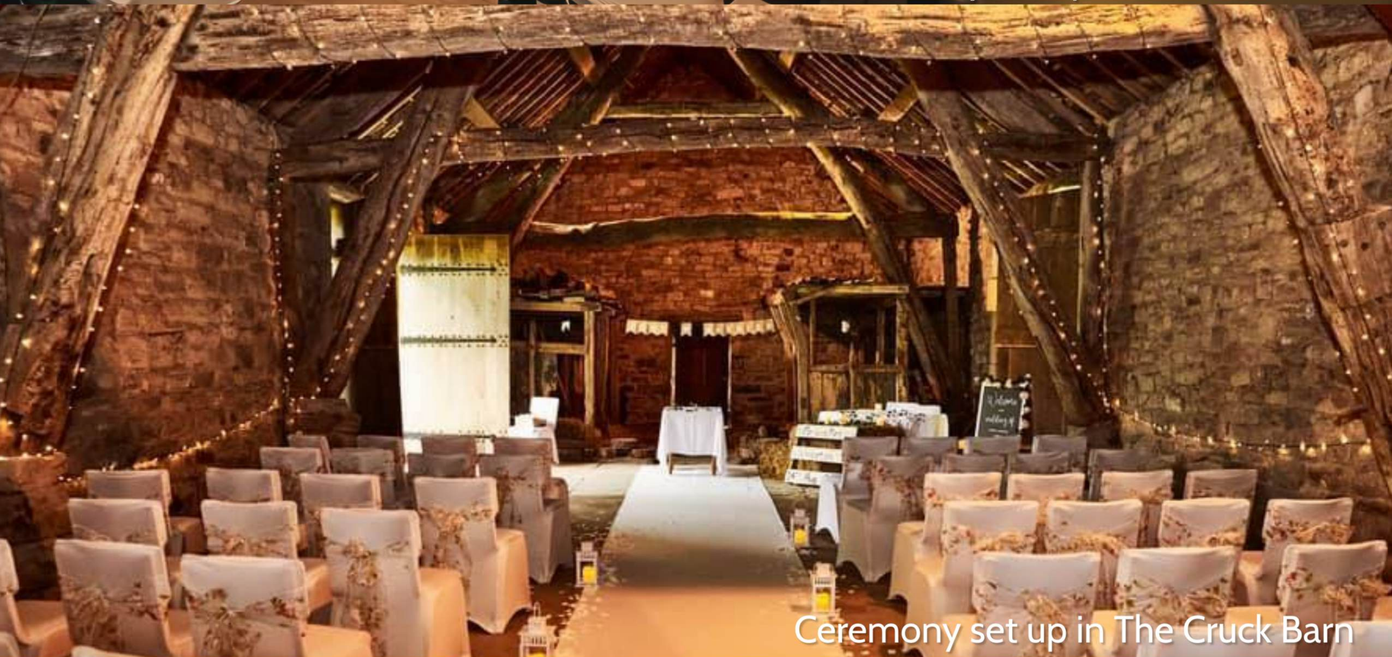
Ceremony set up in The Cruck Barn

The Cruck Barn at Pendle Heritage Centre is a charming venue for weddings, available from March to October due to the lack of central heating. It's perfect for smaller, intimate ceremonies, licensed for up to 80 guests, including the bride, groom, and suppliers. For those seeking a year-round option with a larger capacity, Park Hill Barn can host weddings throughout the year and accommodate up to 120 guests. Both spaces offer a beautiful, rustic atmosphere ideal for creating unforgettable memories.