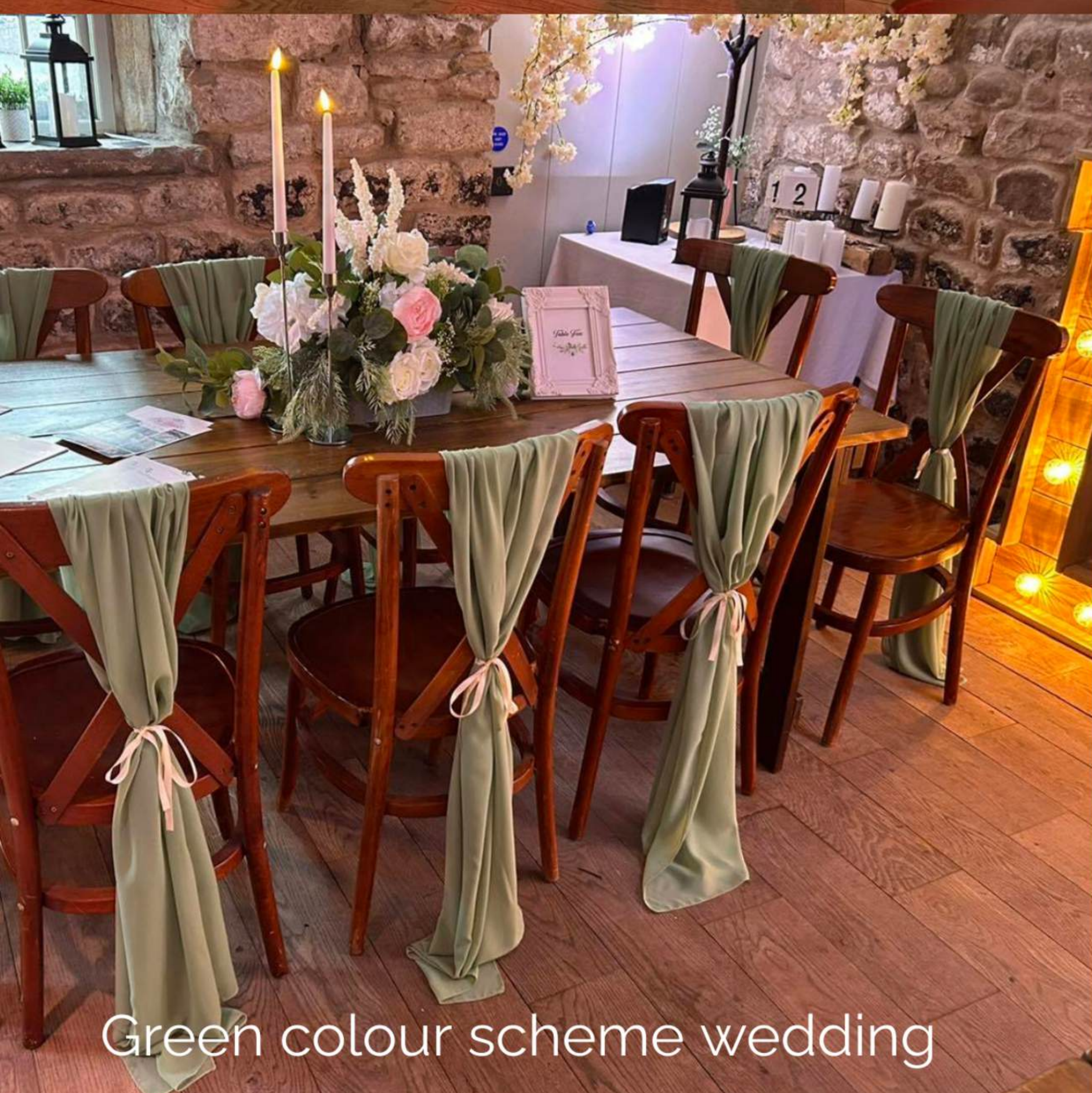
Green colour scheme wedding