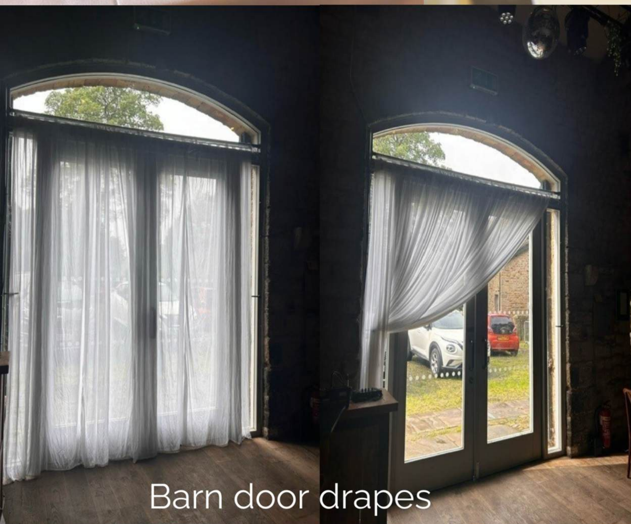
Barn door drapes