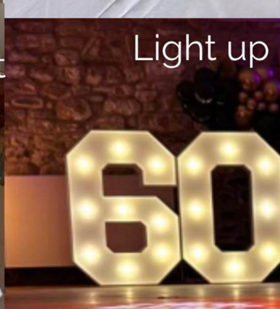
Light up names and numbers