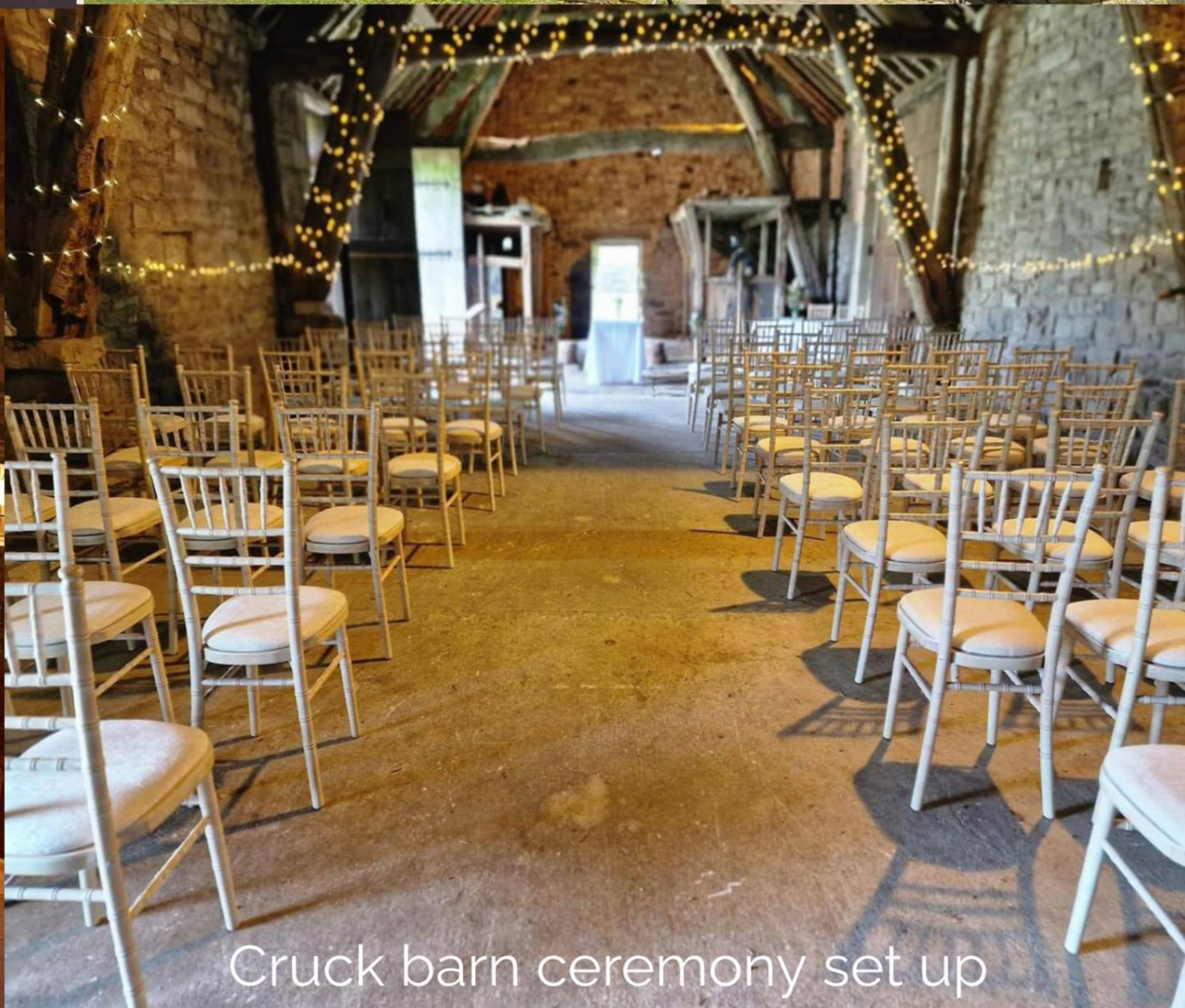
Cruck barn ceremony set up