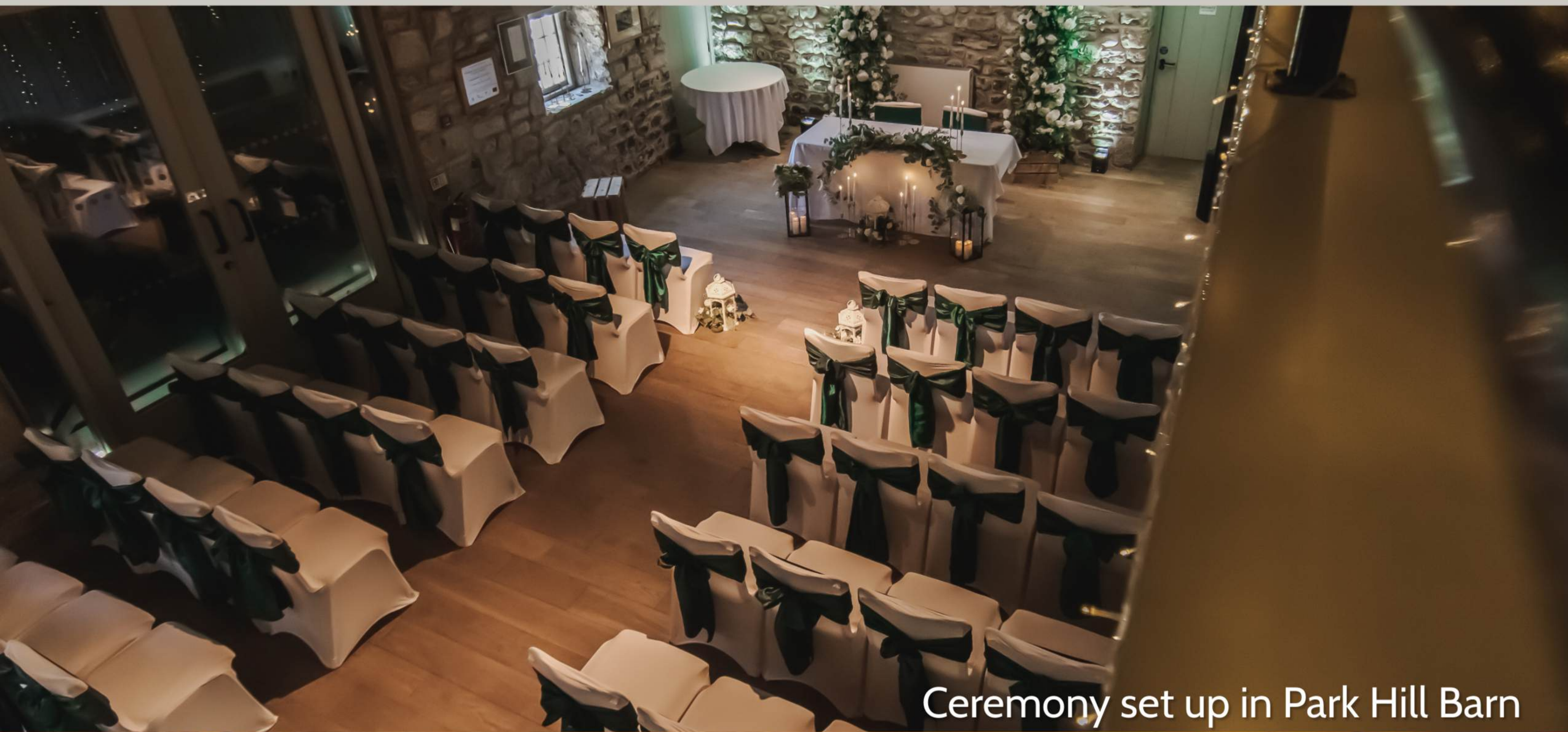
Ceremony set up in Park Hill Barn