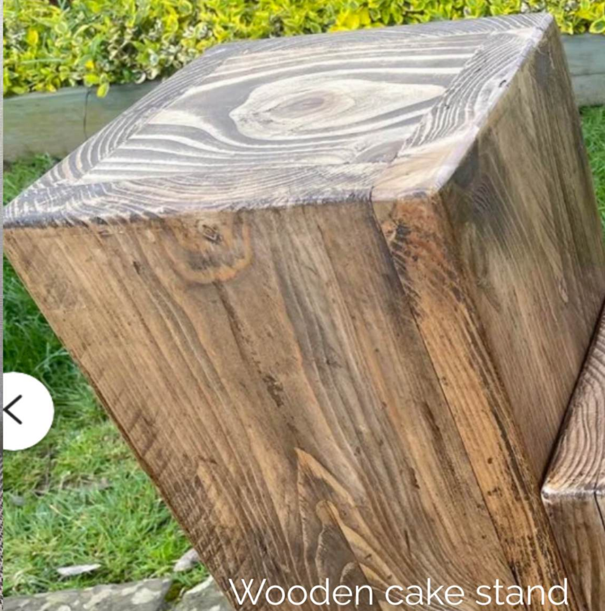
Wooden cake stand