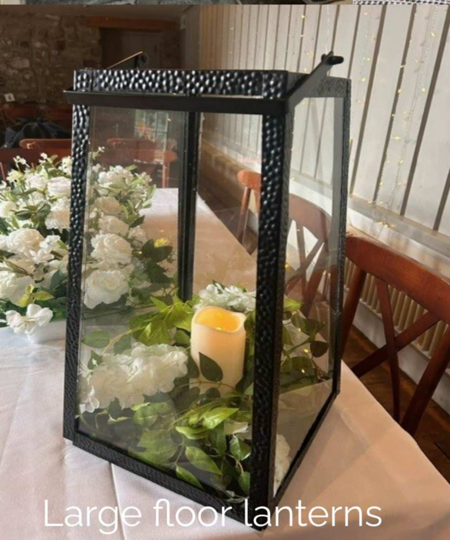
Large floor lanterns