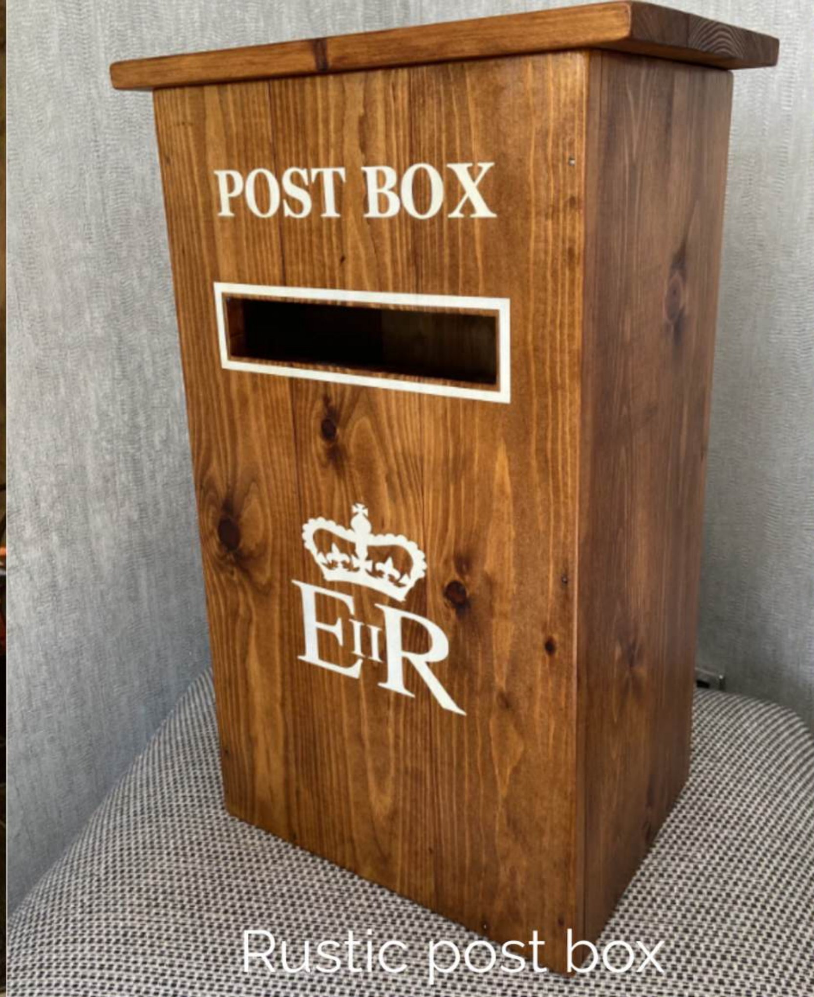
Rustic post box