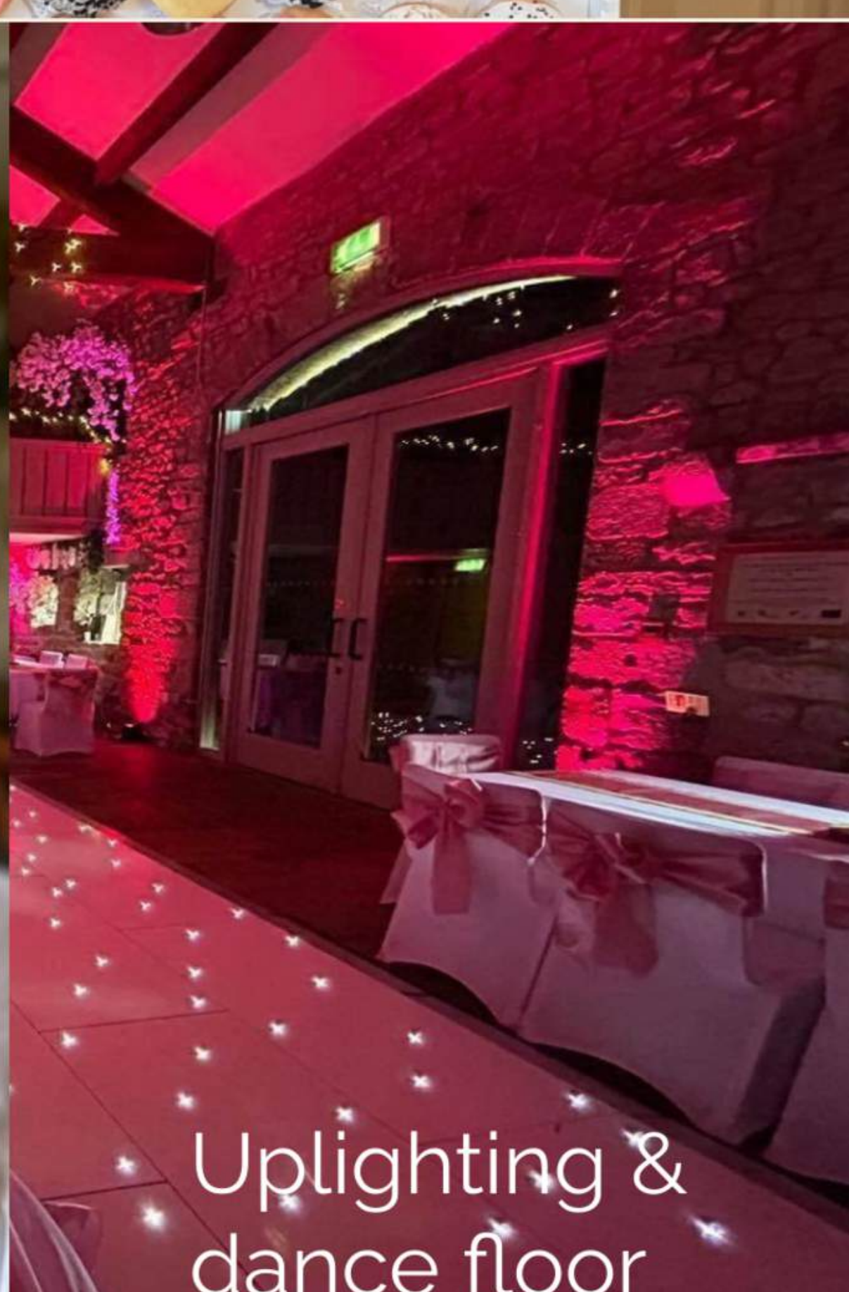
Uplighting & dance floor