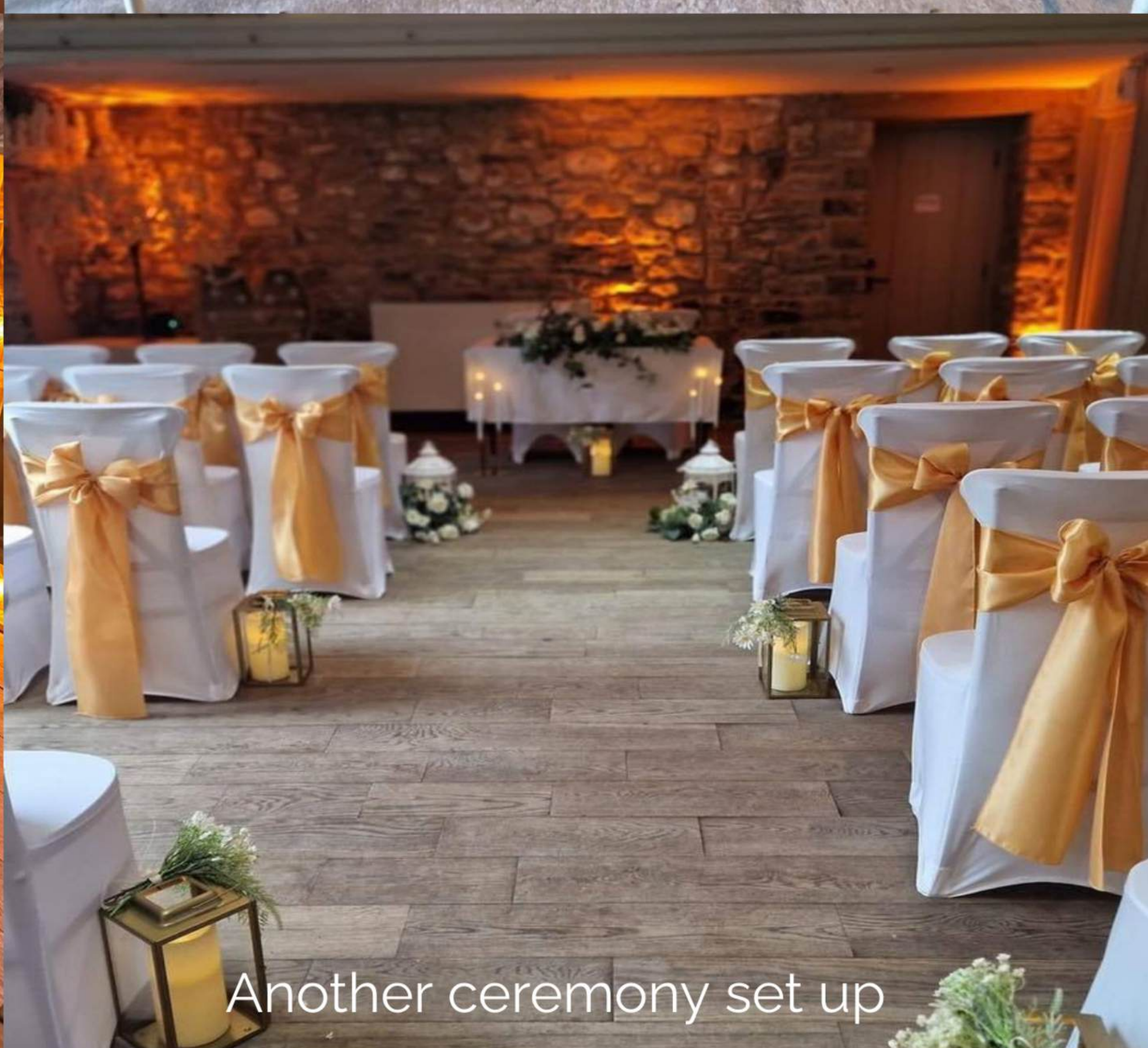
Another ceremony set up