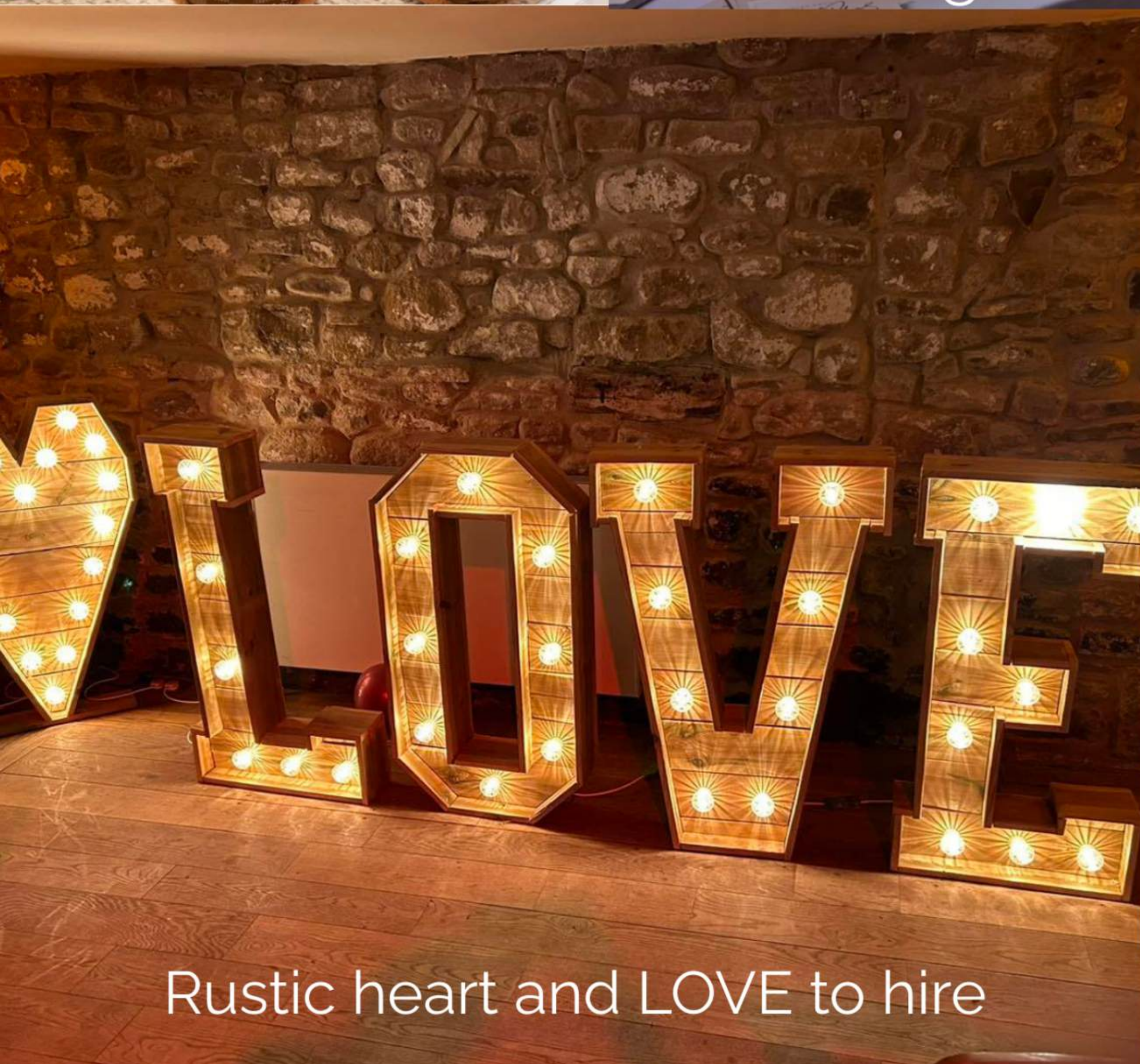
Rustic heart and LOVE to hire