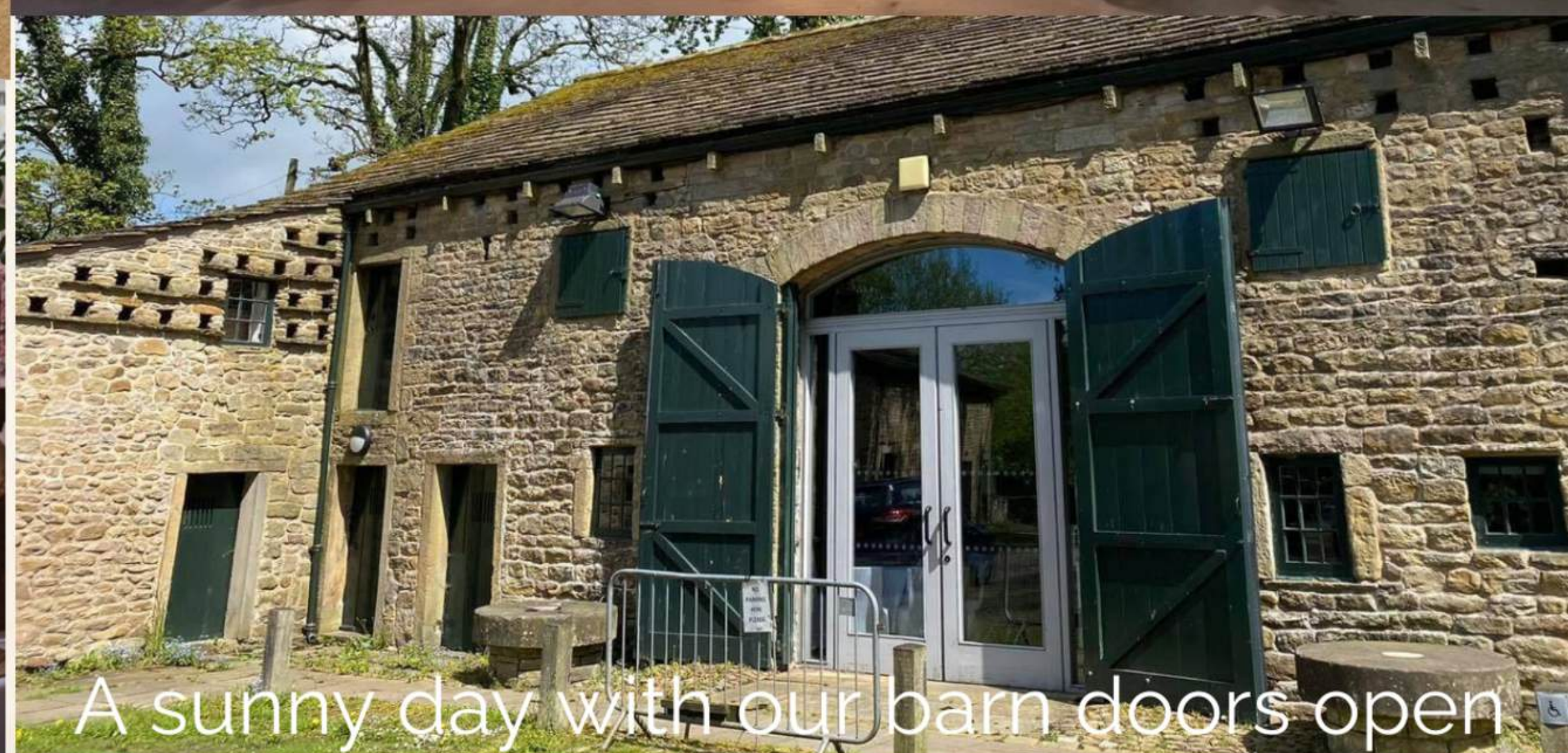
A sunny day with our barn doors open