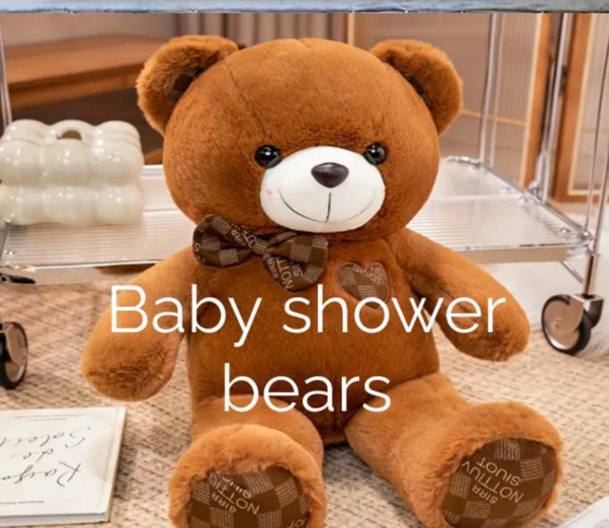
Baby shower bears