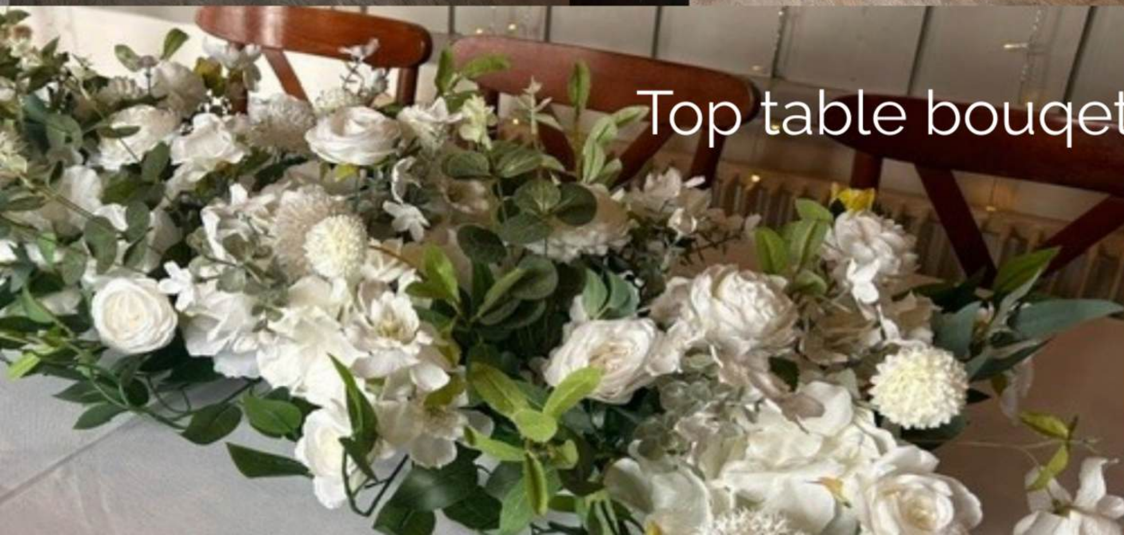
Top table bouquet