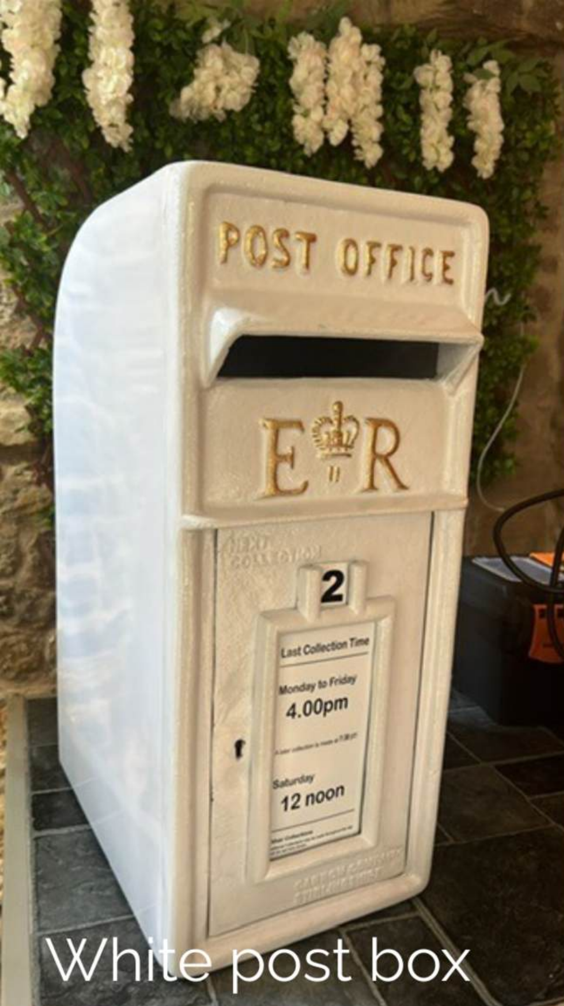
White post box