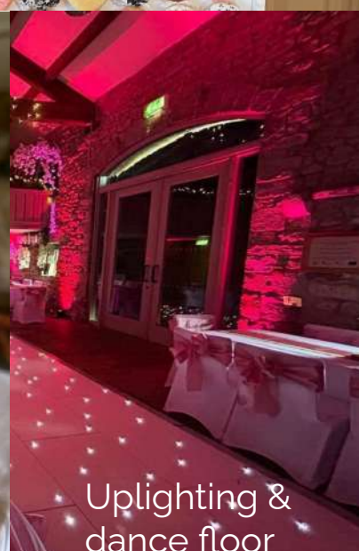
Uplighting & dance floor