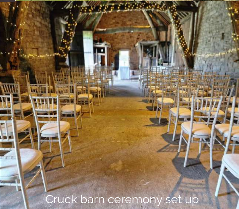
Cruck barn ceremony set up