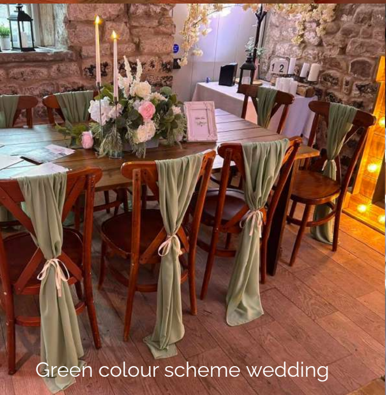
Green colour scheme wedding