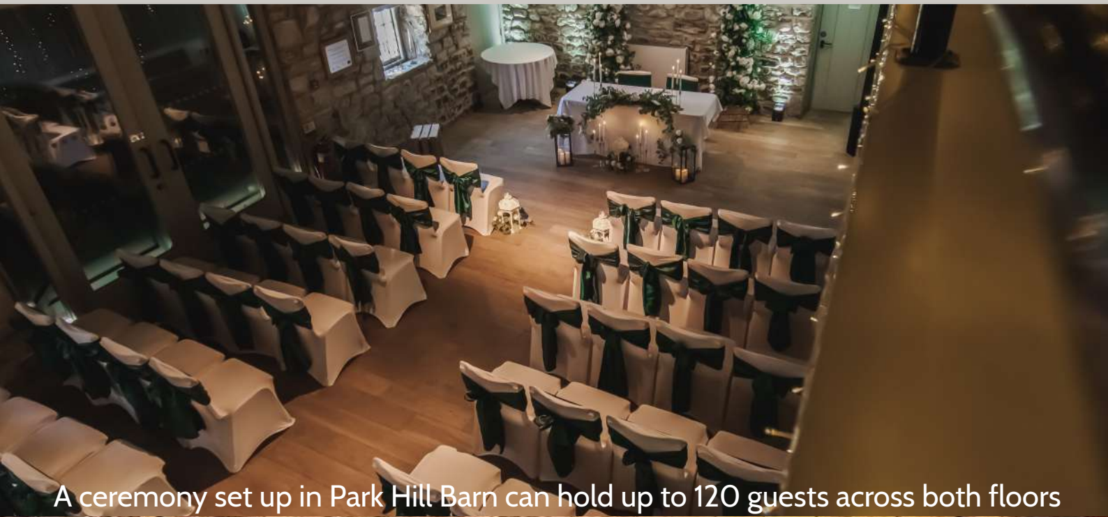
A ceremony set up in Park Hill Barn can hold up to 120 guests across both floors