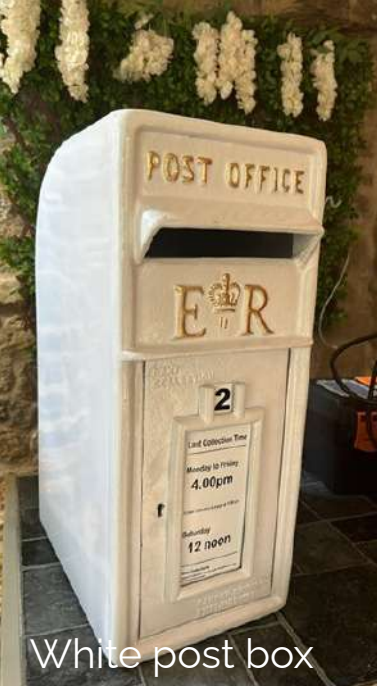
White post box