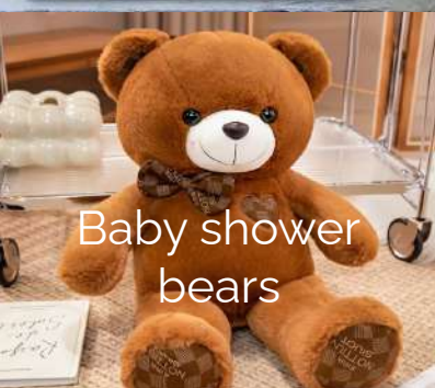
Baby shower bears