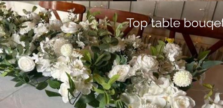
Top table bouquet