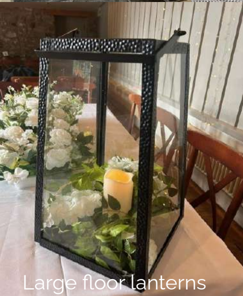
Large floor lanterns