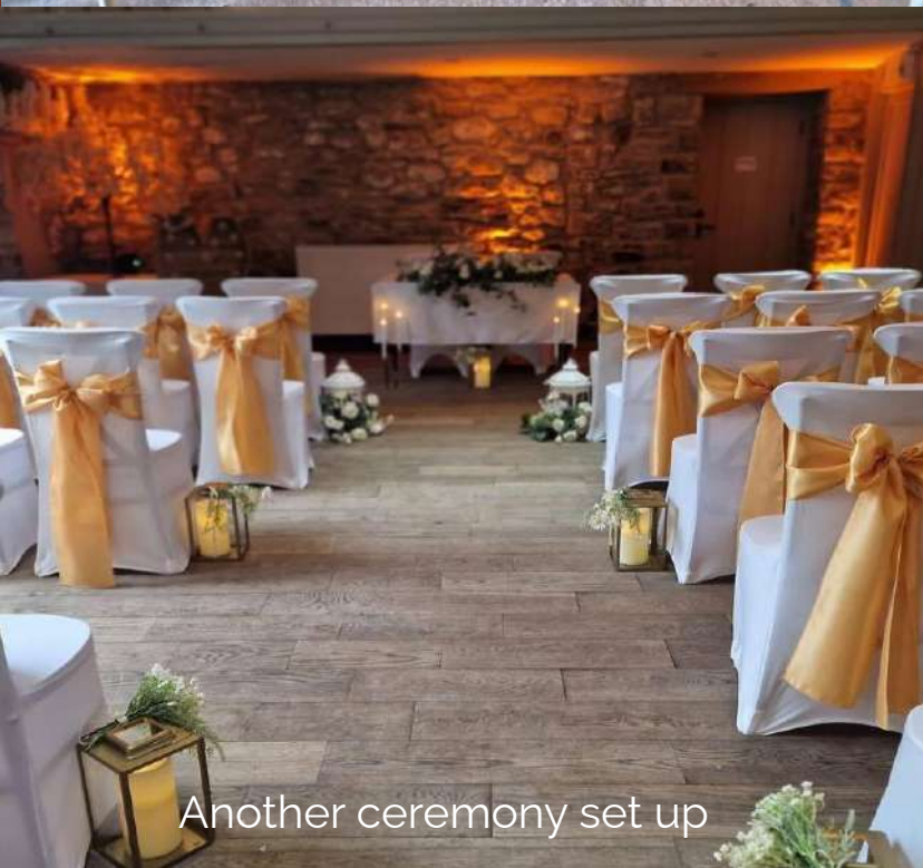
Another ceremony set up