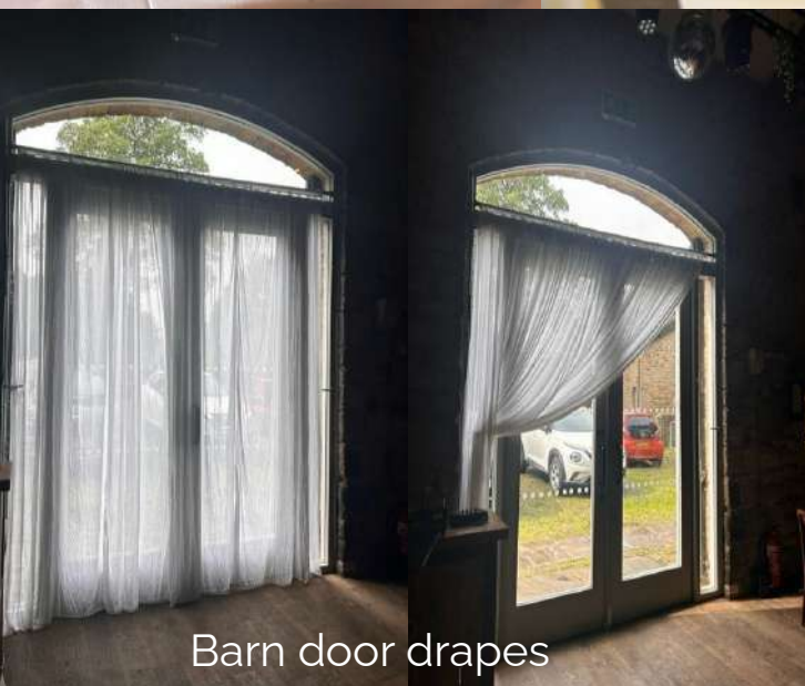
Barn door drapes