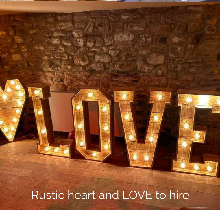
Rustic heart and LOVE to hire