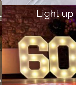
Light up names and numbers