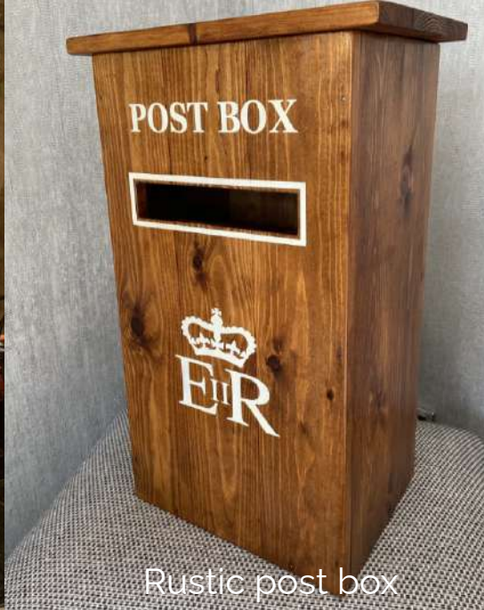
Rustic post box