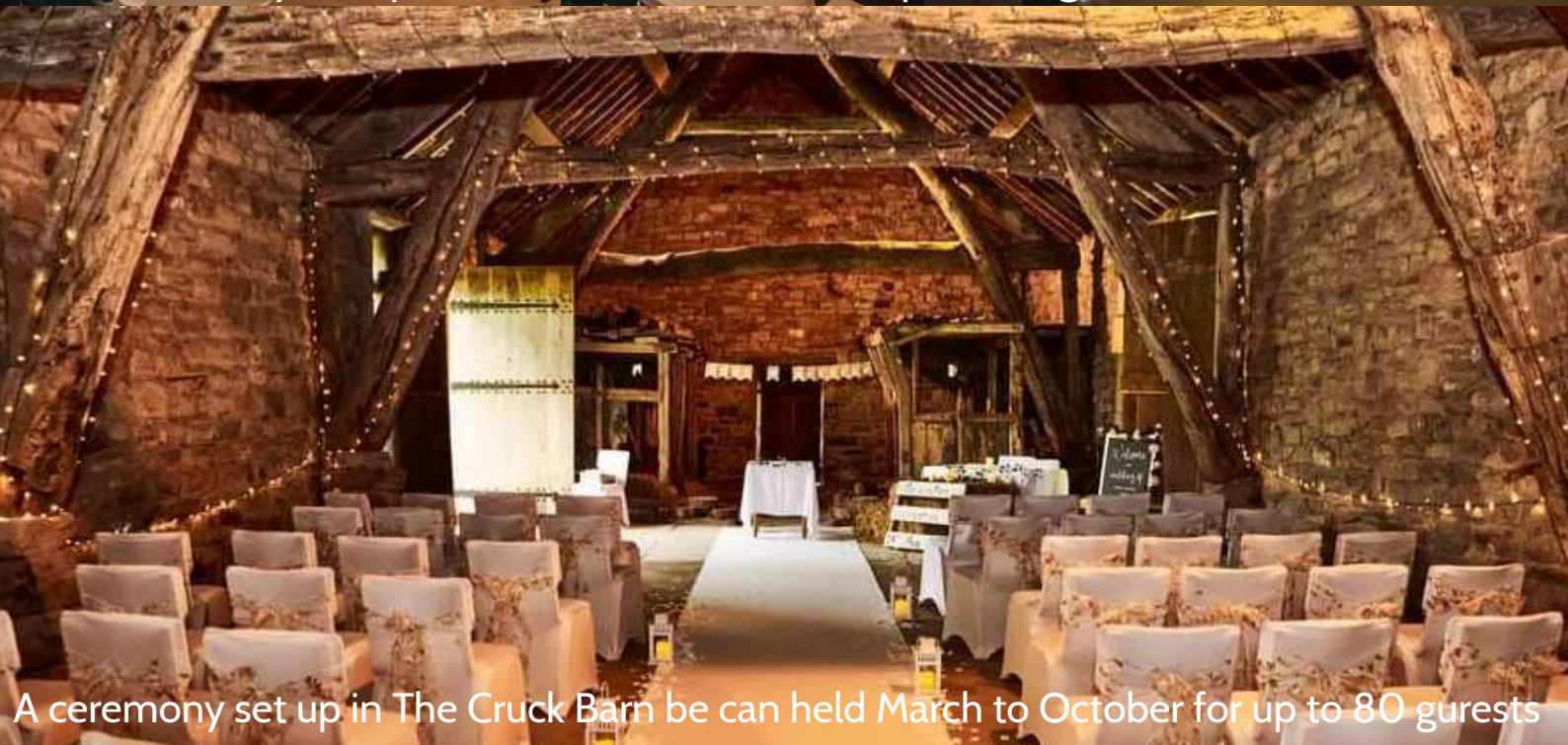
A ceremony set up in The Cruck Barn can be held March to October for up to 80 guests

The Cruck Barn at Pendle Heritage Centre is a charming venue for weddings, available from March to October due to the lack of central heating. It's perfect for smaller, intimate ceremonies, licensed for up to 80 guests, including the bride, groom, and suppliers. For those seeking a year-round option with a larger capacity, Park Hill Barn can host weddings throughout the year and accommodate up to 120 guests. Both spaces offer a beautiful, rustic atmosphere ideal for creating unforgettable memories.