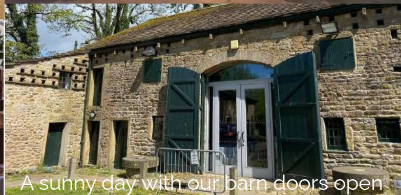
A sunny day with our barn doors open