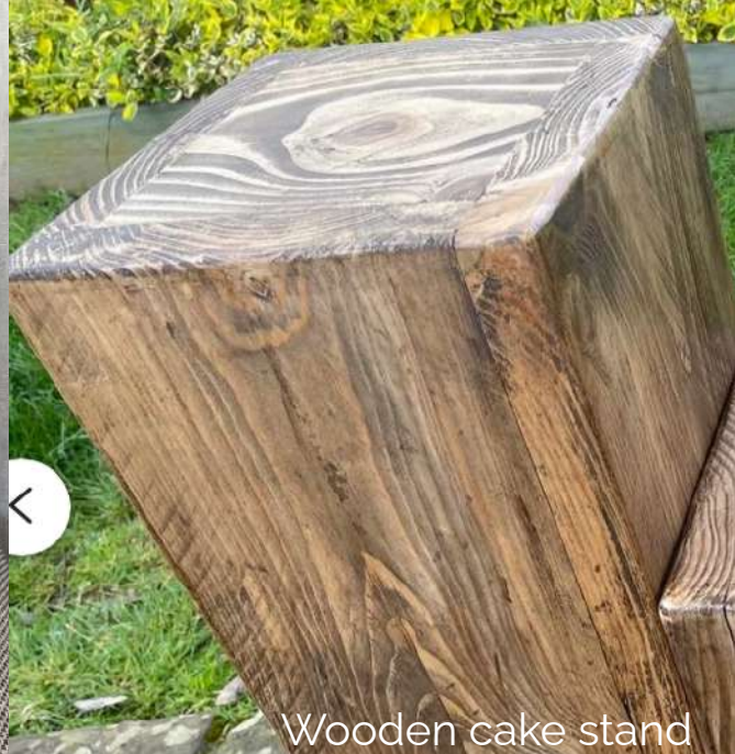
Wooden cake stand