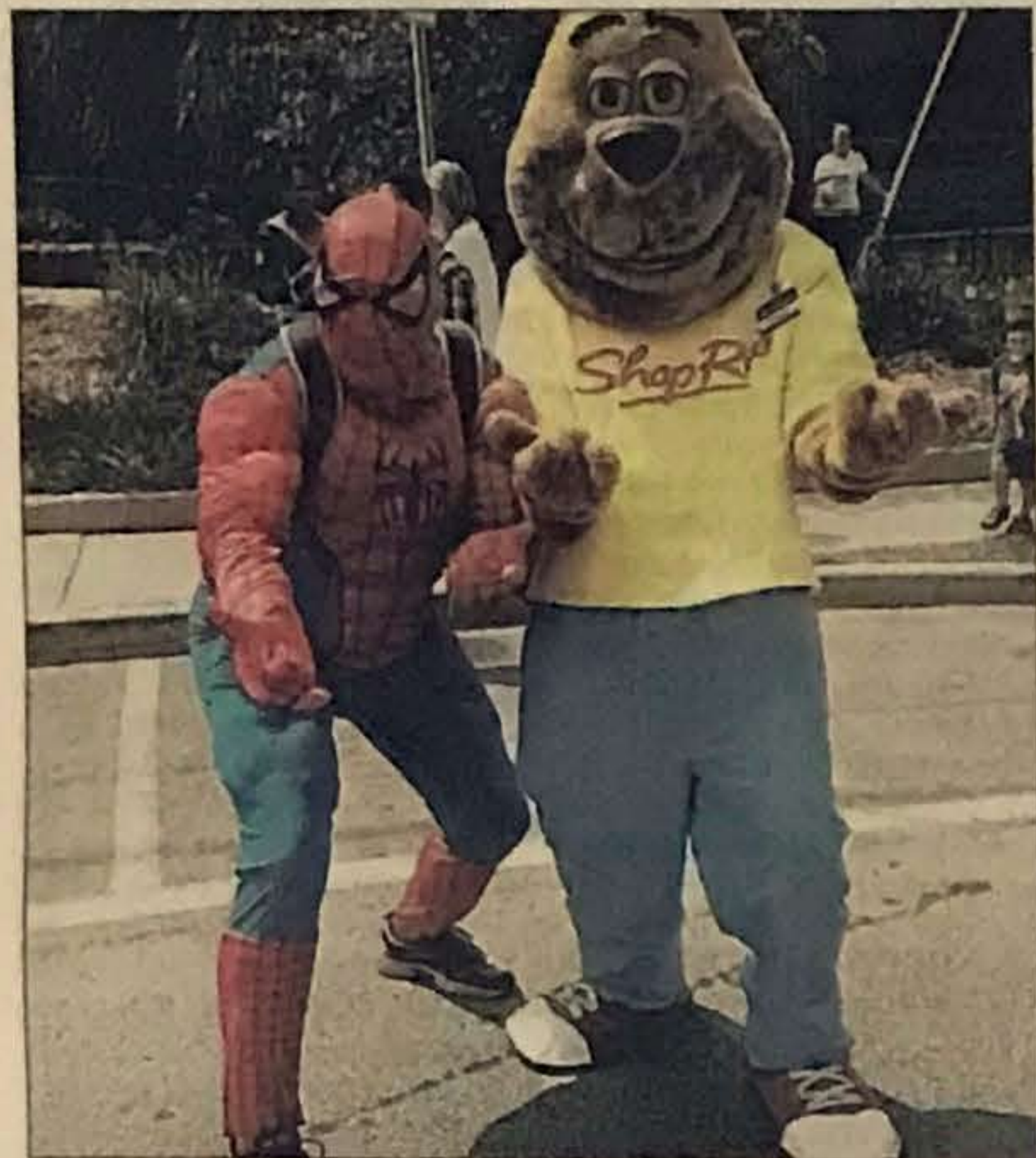
Spiderman and ShopRite's Scrunchy the Bear were on hand to liven up the festivities!