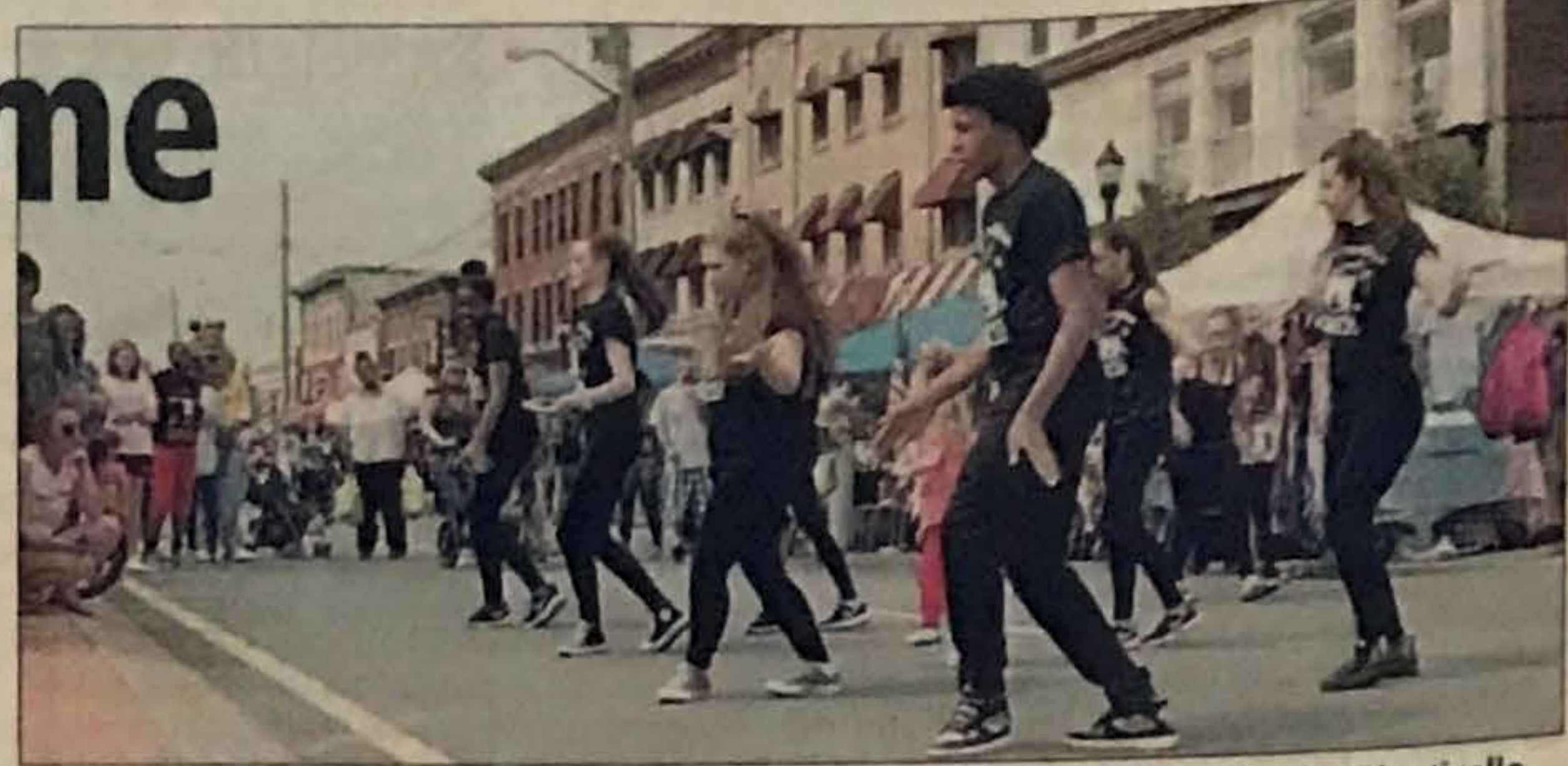
Live entertainment, including a dance team, kept the crowds cheering on Broadway in Monticello.