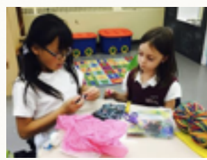
Hands-on experiences reinforce key concepts and