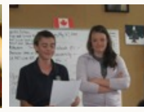
Accountability, responsibility and ownership over their