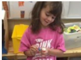
Children learn numeracy and literacy through play-based

Students are introduced to letters, numbers, and reading readiness through play-based activities determined by their passion areas. Children are engaged and have fun while learning the fundamentals that will form a solid foundation for their future. We also provide learning through music, physical education activities and field trips.