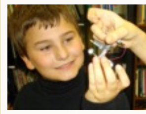
Applying concepts through experiments increases

The lower elementary program teaches students how to use their interests to complete objectives through our student-directed program. Students become proficient in numeracy and literacy through specialized programs. They learn how to make good choices in their learning to increase retention and personal success while having fun!