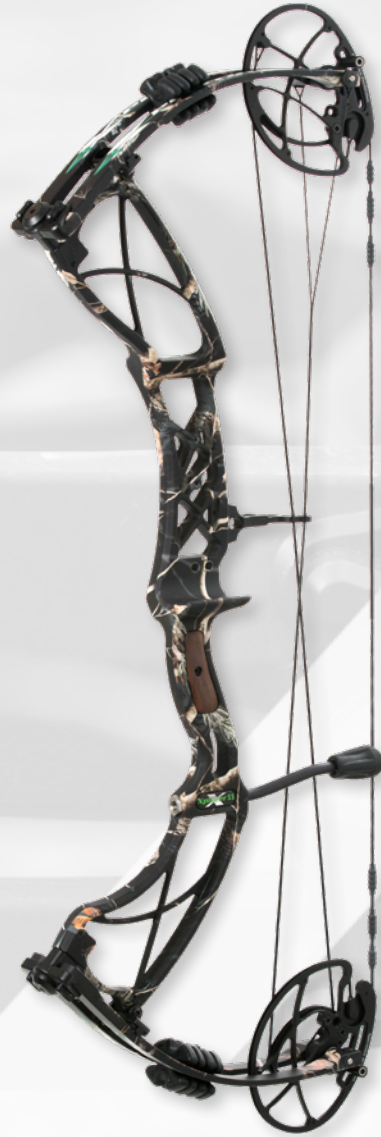
REALTREE AP BLACK