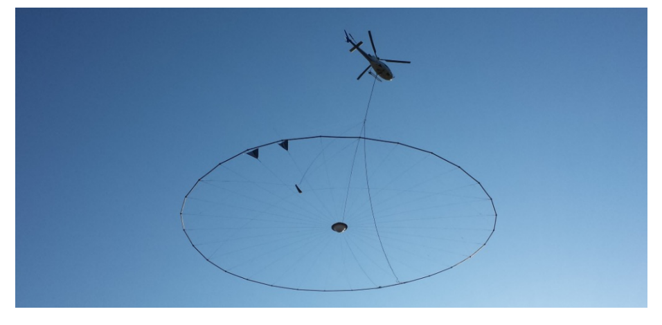
HeliTEM<sup>2</sup> helicopter time-domain AEM Survey

The Board of Directors of Coolabah Metals Limited authorised the release of this announcement.