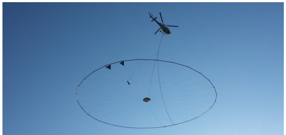
HelITEM 2 helicopter time-domain AEM Survey

The Board of Directors of Coolabah Metals Limited authorised the release of this announcement.