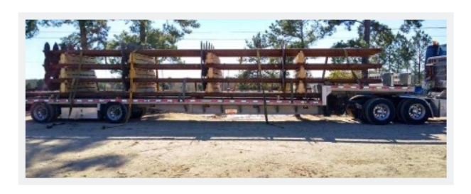
"Driver safety is our #1 concern so keeping in constant communication with every driver manager was extremely important." -Racquelle Pakutz

To meet this demand, Zen Freight Solutions reorganized the logistics of the project and increased the shipments to 2 and 3 truckloads per day. With limited capacity and contract pricing, Zen Freight went to work on carrier relationships by matching lanes with drivers in need. Team drivers with 53' stepdecks were brought in to run round-trips between the Northern and Southern United States during the remaining month of January and into February 2020.