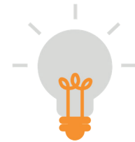
Focus on specific skills within wider context