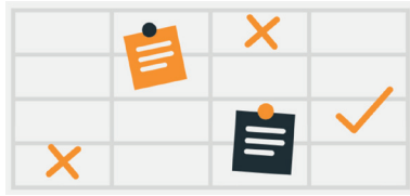
Focus on tasks & deliverables, not time

Our XPMCs are backed by university partners, professional bodies and globally-recognised employers, and are built around three design principles: