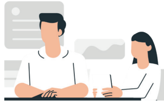
Work in teams, not as individuals