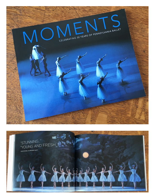
Project: Moments, Pennsylvania Ballet's 50 th Anniversary Book Client: Pennsylvania Ballet