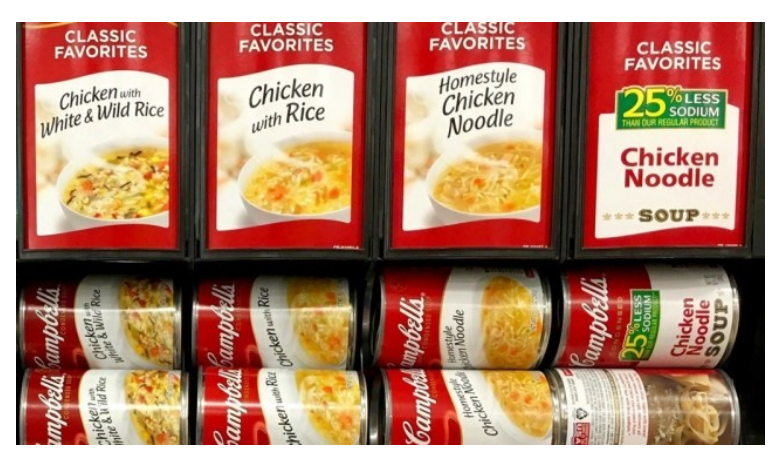
"Souper Bowl" Canned Soup Drive

Let's get going with the "Souper Bowl" can soup drive. If each person brings just one can of soup, it will go a long way toward keeping our people filled up with good nutrition and warmth for the winter. Please bring cans of soup to the church by Sunday, February 9, 2020. Let's see which soup will win this year.