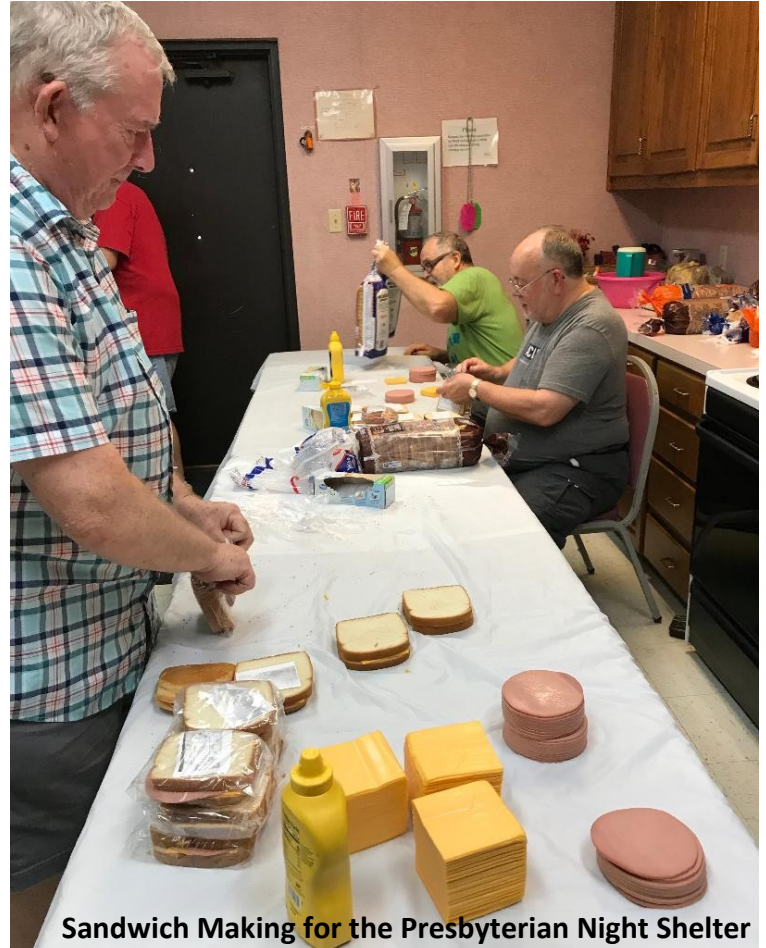
Sandwich Making for the Presbyterian Night Shelter