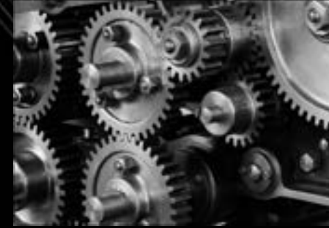
Post Implementation Reviews