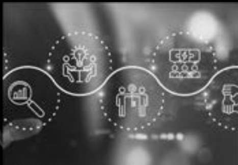
Governance & Assurance