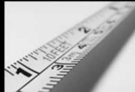
Measurement & Reporting