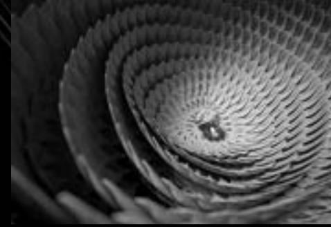
ESG & Sustainability