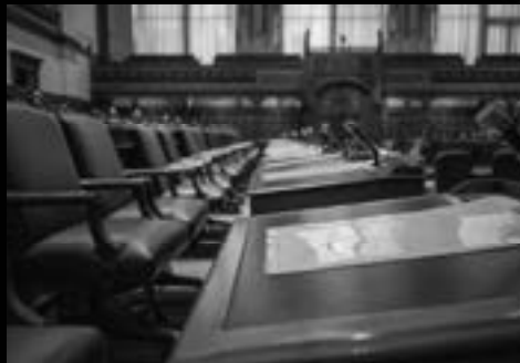
Local Government & Public Sector