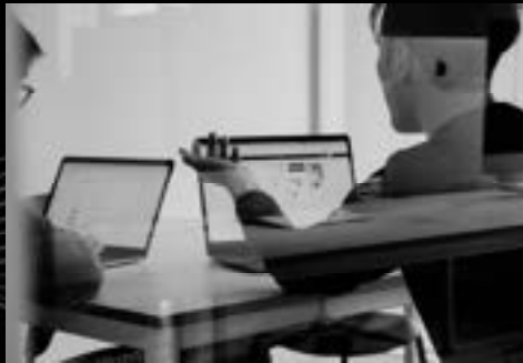
Business Case Advisory