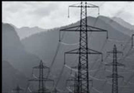
Energy Industry Advisory