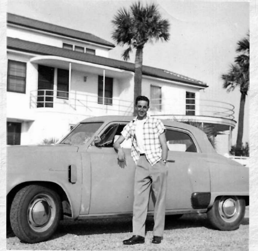
Receipt showing Pete purchased the Studebaker Champion May 28, 1954 for $525.00