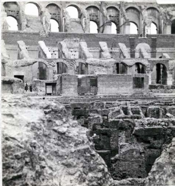
The Roman Colosseum