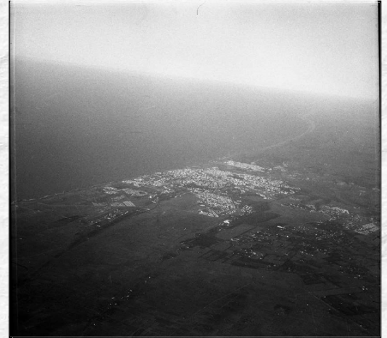
Northern coast of Africa and the Mediterranean Sea