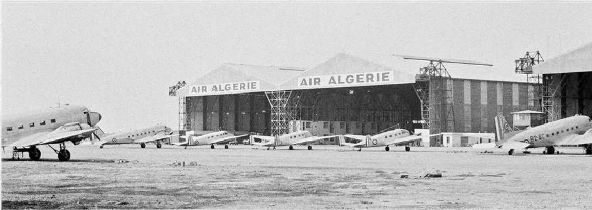
Algerie airport where they first landed on their way to Italy