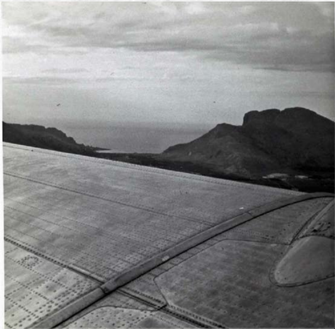
Flying over the Island of Sardinia