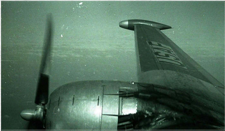
Flying over the Mediteranean in rough weather