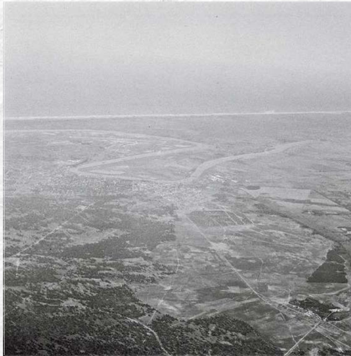
The mainland of Italy