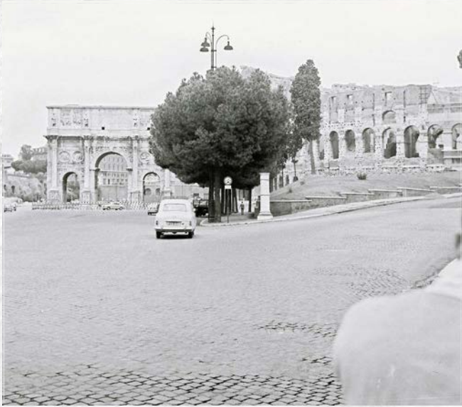
Approaching the Colosseum