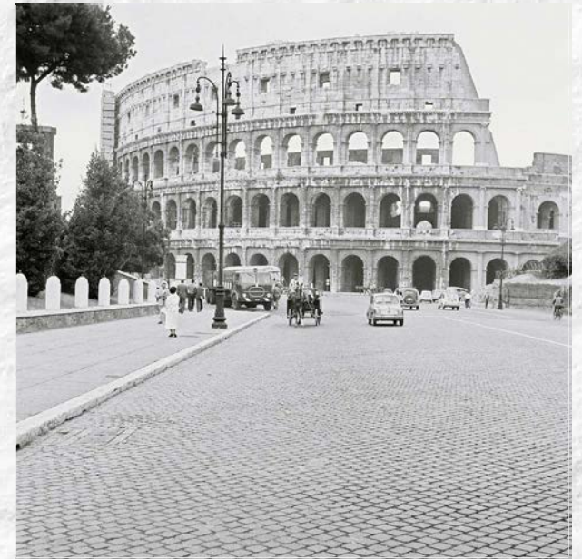
The Roman Colosseum