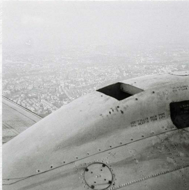
FLYing over Rome