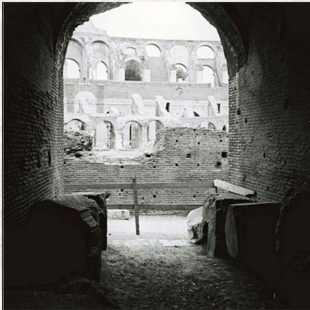
Entrance into the Roman Colosseum