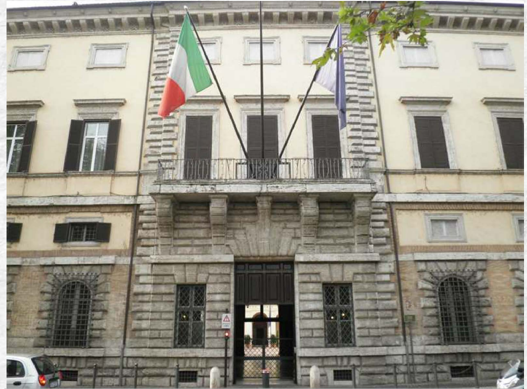
Hotel Palazzo Salviati from Google Earth 2020