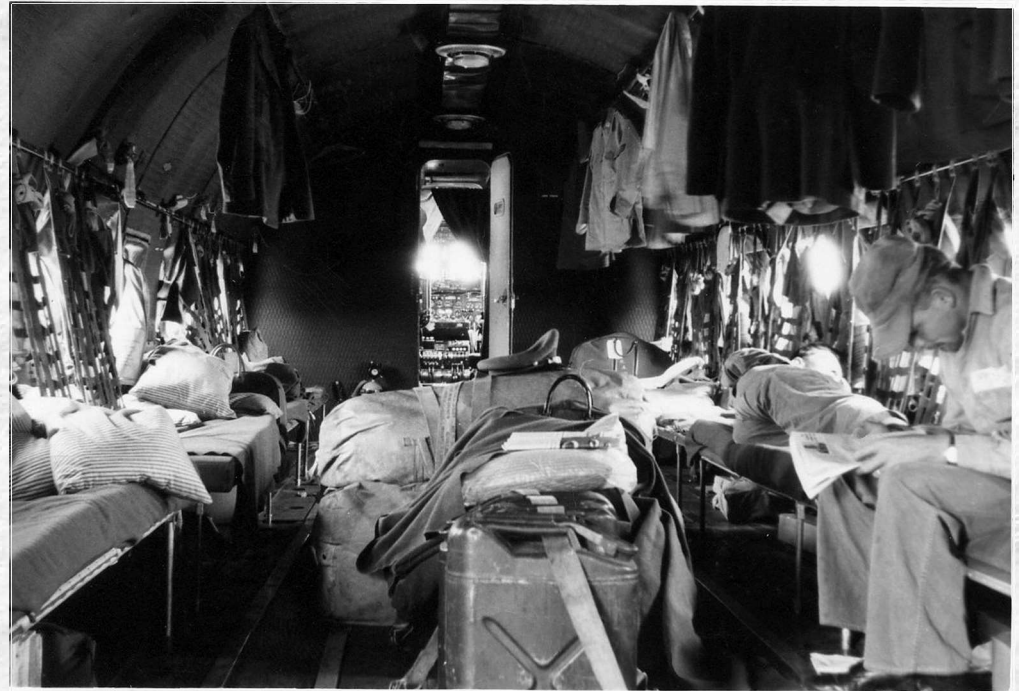
The print date stamp on the photo above is Nov 1956. Therefore, this photo was taken on Pete's return flight back to the States from North Africa on a DC7. Below is a photo Pete took of the DC7 he flew on.