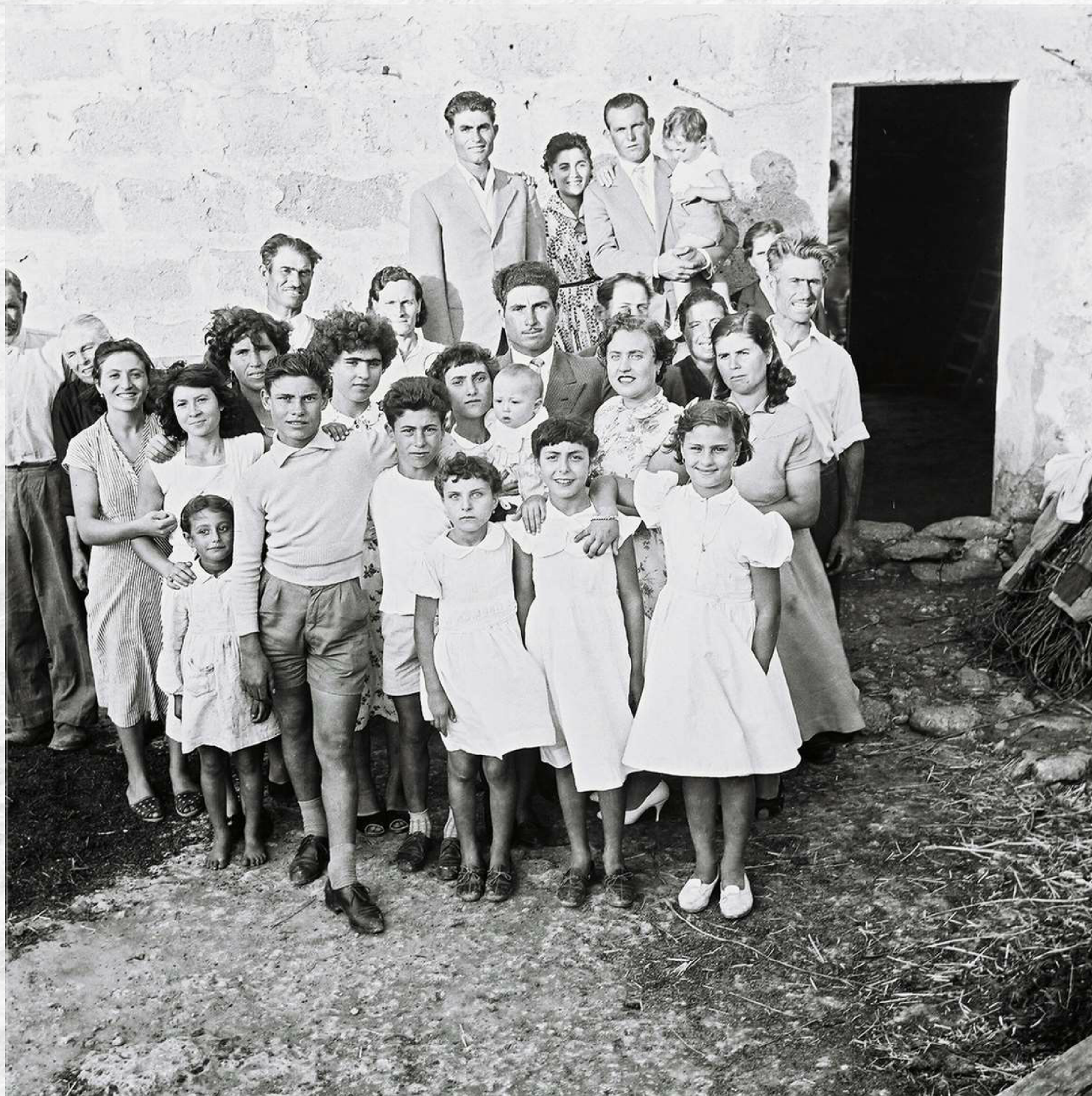
Original photo without all the names attached to individual images.