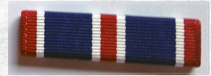
Outstanding Unit Award for winning the bombing contest