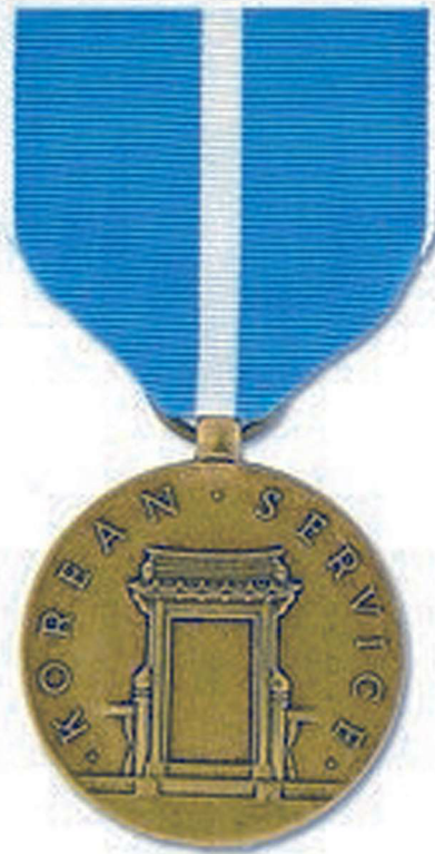
Korean War Service Medal and Ribbon