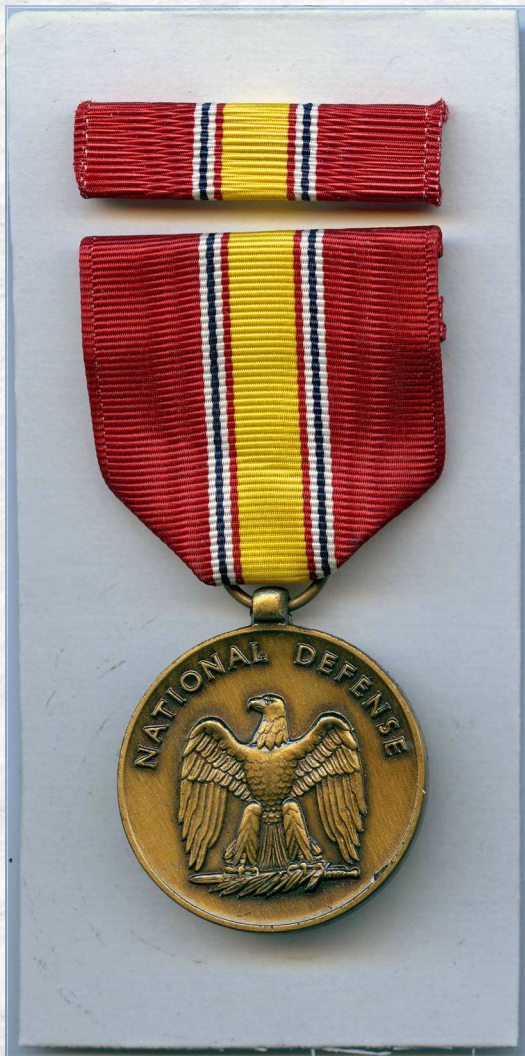
National Defense Service Medal and Ribbon