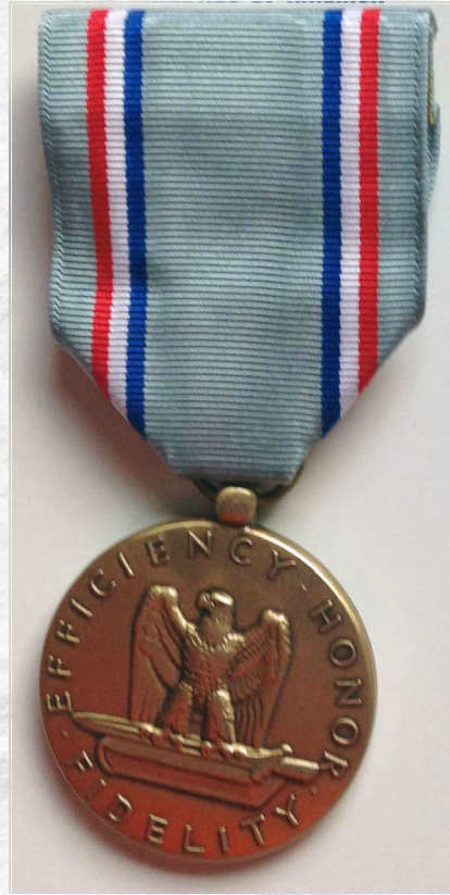
Good Conduct Medal and Ribbon