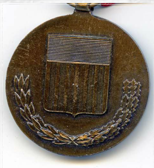
Back of both medals