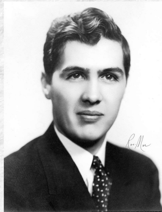
1948 First election photo. Ran for and won the County Recorder position.