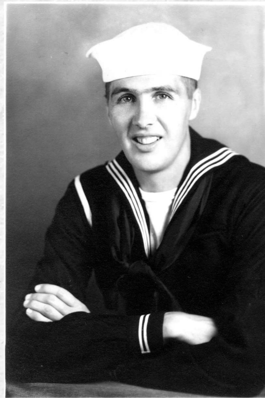
Military photos are from 1944-1945