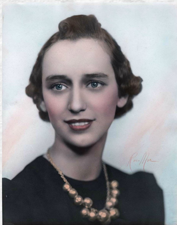
Engagement photo Feb 14, 1940