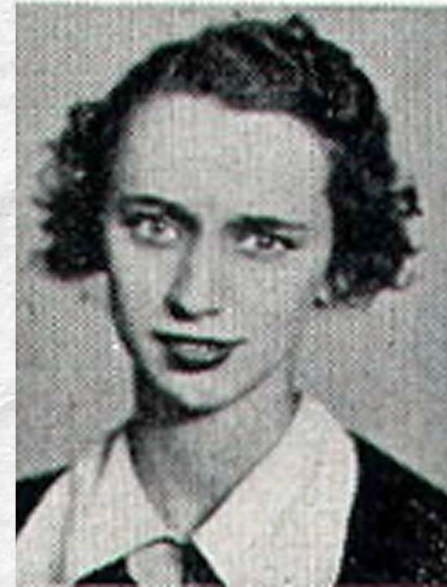
1937 Junior photo at Rockford, HS

Age: 1 Birth Year: abt 1919 Birthplace: Illinois Home in 1920: Rockford Ward 2, Winnebago County, Illinois Race: White Gender: Female Relation to Head of House: Granddaughter Marital Status: Single Father's Birthplace: Illinois Mother's Birthplace: Illinois