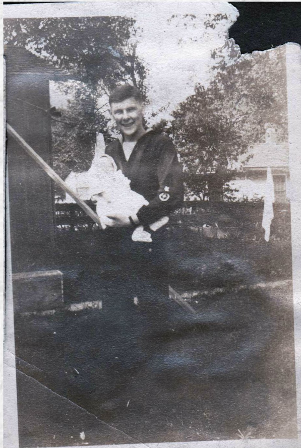
About 20 years of age