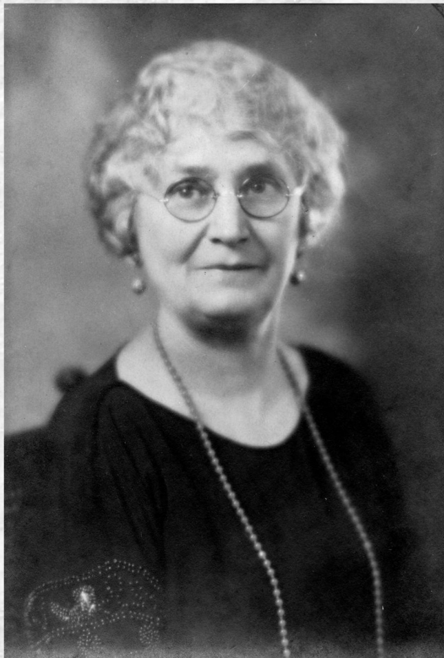
This photo was taken for their golden anniversary