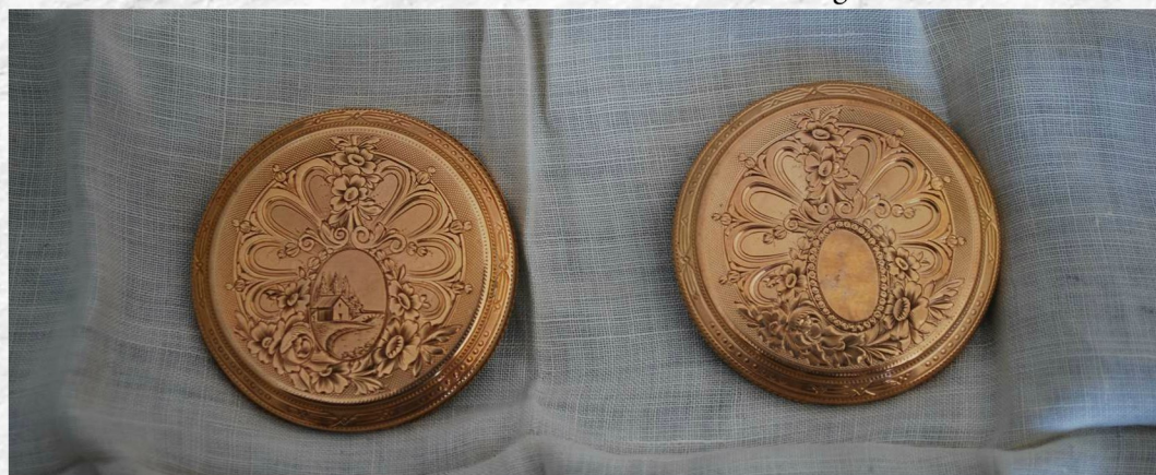
The pins that she wore at her wedding. Note that they were made from a pocket watch and are the front and the back piece. Owner of the watch is not known.