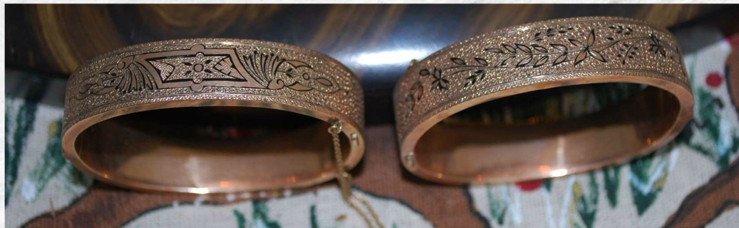
The bracelets she wore at her wedding