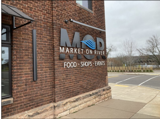
Owned by the Wisconsin Farmers Union (WFU) is the newly remodeled Market on River.