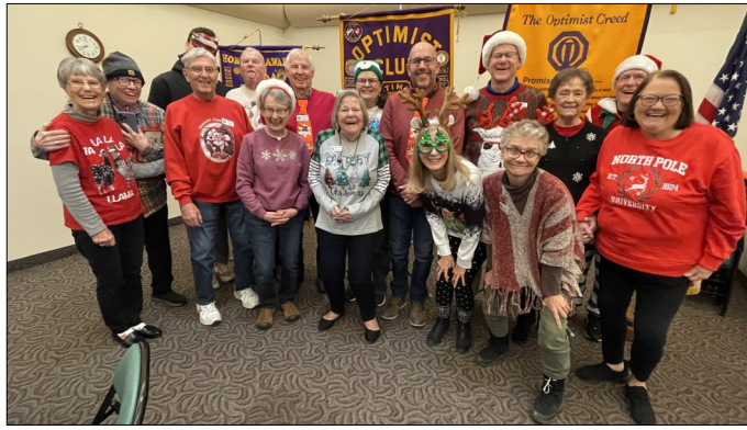
Club members ham it up at our Christmas Breakfast Celebration.