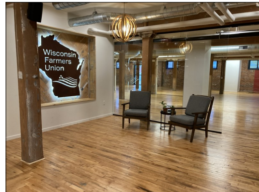
Rooms adjacent to the WFU corporate headquarters may be rented out for conference meetings and special events.