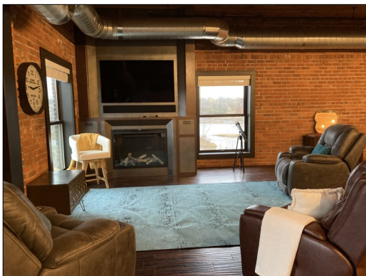
The living room area of the Airbnb overlooks the Chippewa River and River Front Park.