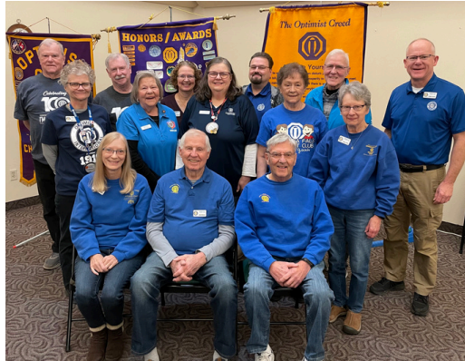
Our club members showing off our Optimism at our weekly meeting.