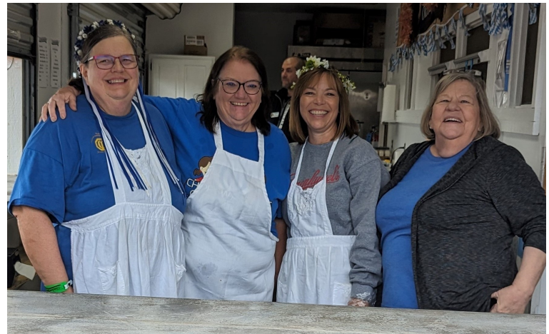
Friday Front Crew