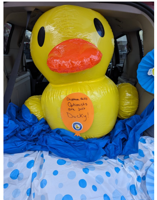
The Optimist Duck