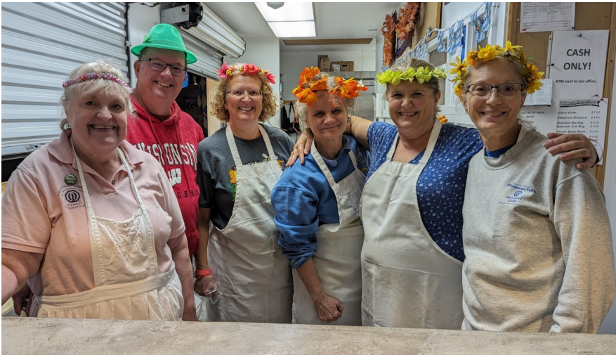
Saturday Night Volunteers