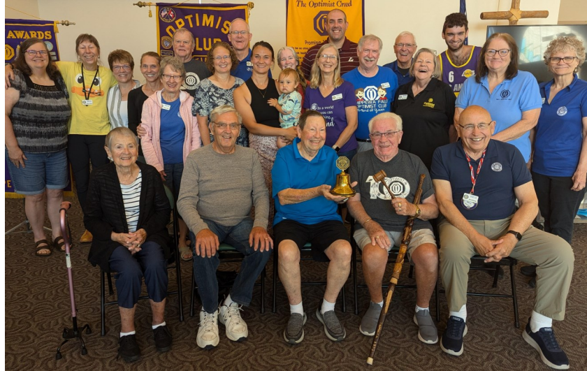
Members and guests at Chippewa Falls Optimist Club's 55th Anniversary

Sokup's Market 624 N Bridge St Chippewa Falls, WI 54729 715.723.4953