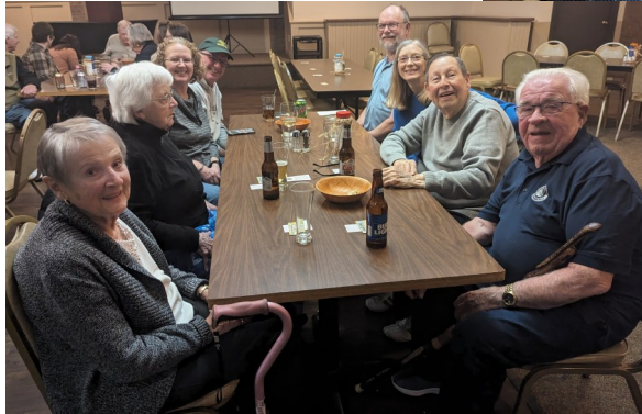
Twenty members and their families, pictured above and on left, attended our evening Spring Fling meeting on April 24, 2024 at the Fill Inn Station.