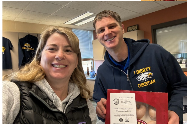
Liberty Christian School