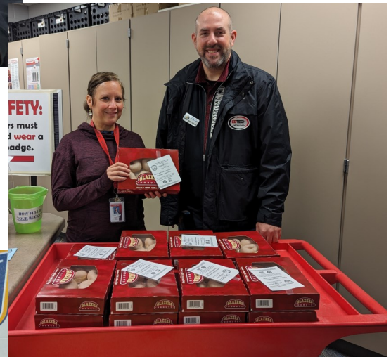
Chippewa Falls Middle School