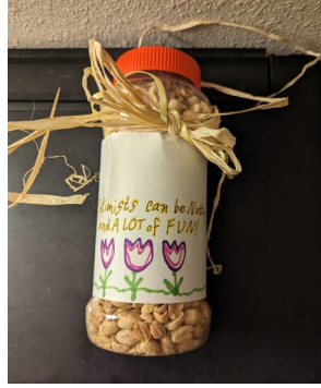
Door prizes were jars of peanuts with the label "Optimists can be Nutty and A LOT of FUN!"