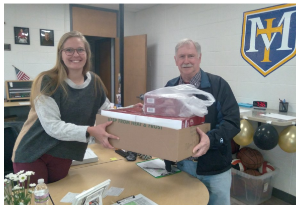
McDonell Central Catholic High School