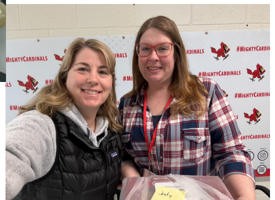
Chippewa Valley High School