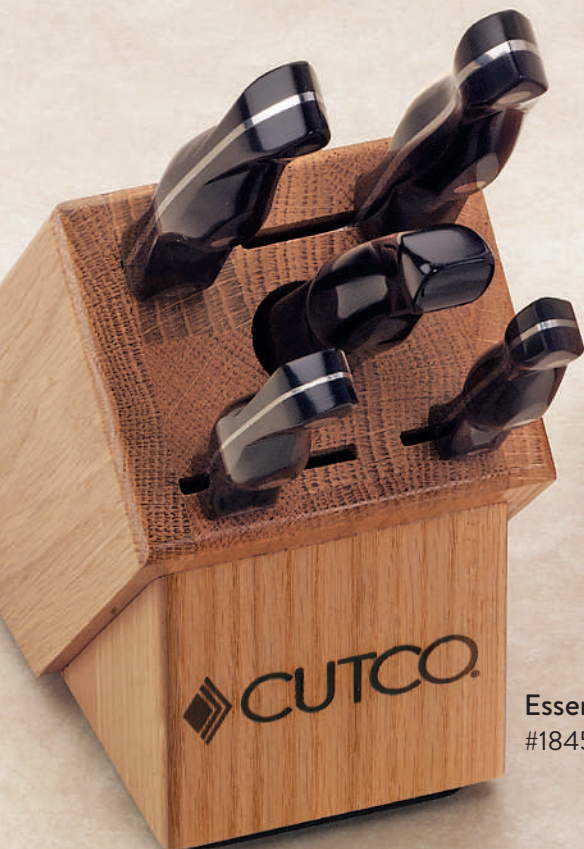
Essentials Set #1845C