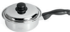
2 Qt. Sauce Pan & Cover #992