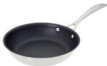
8" Nonstick Fry Pan #858