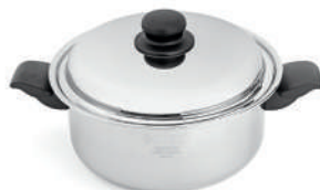
4 Qt. Dutch Oven & Cover #994