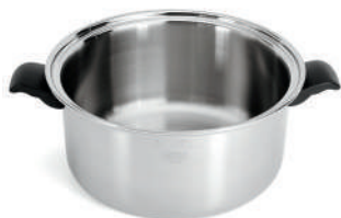
6.3 Qt. Dutch Oven Bottom #995