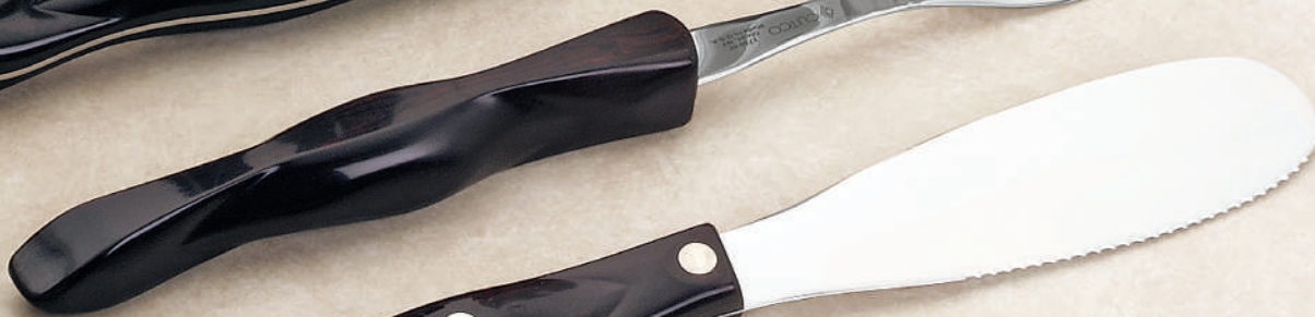
Spatula Spreader #1768C