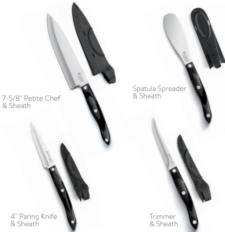
7-5/8" Petite Chef & Sheath