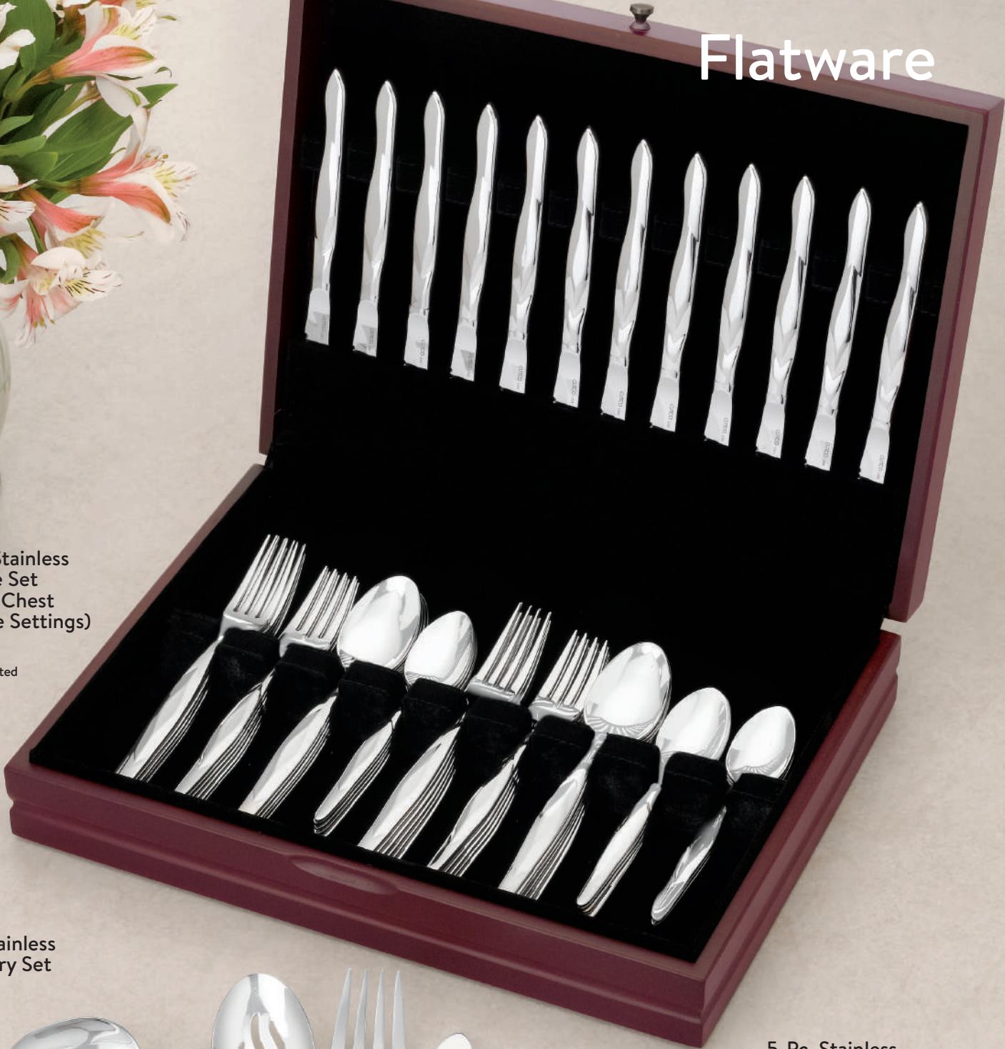
60-Pc. Stainless Flatware Set in FREE Chest (12 Place Settings) #1984 Chest: Imported