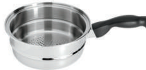
Steamer Insert - fits 3 Qt. #997