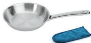
8" Gourmet Fry Pan #938 Handle Mitt #278

Includes 6 cookware pieces PLUS a Cutco Cooking Guide.