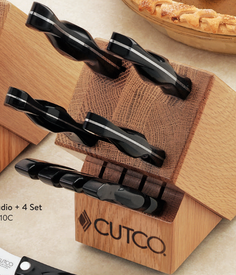
Studio + 4 Set #1810C