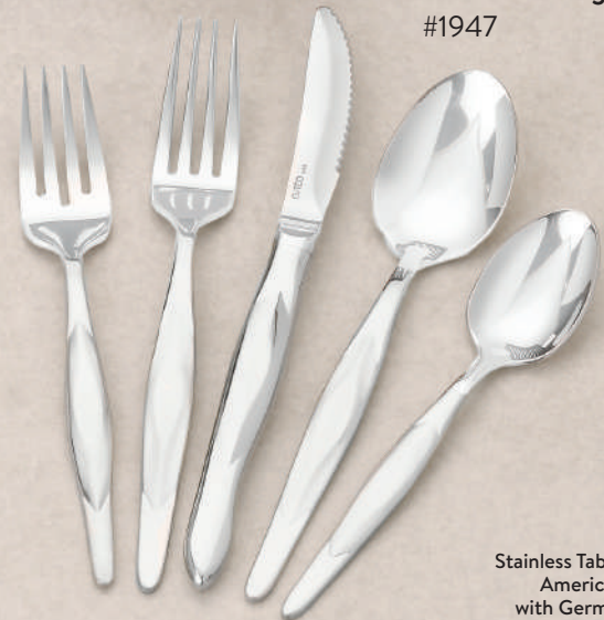
5-Pc. Stainless Place Setting #1947

Stainless Table Knife: American Made with German Steel