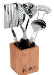
5-Pc. Kitchen Tool Set w/ Holder #1718C Classic #1718W Pearl