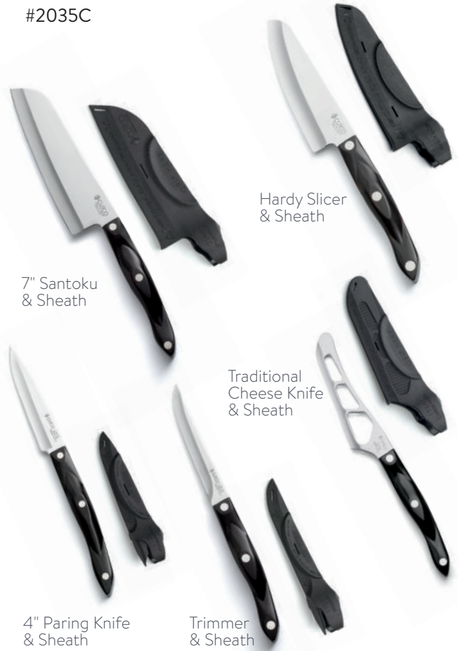
7" Santoku & Sheath