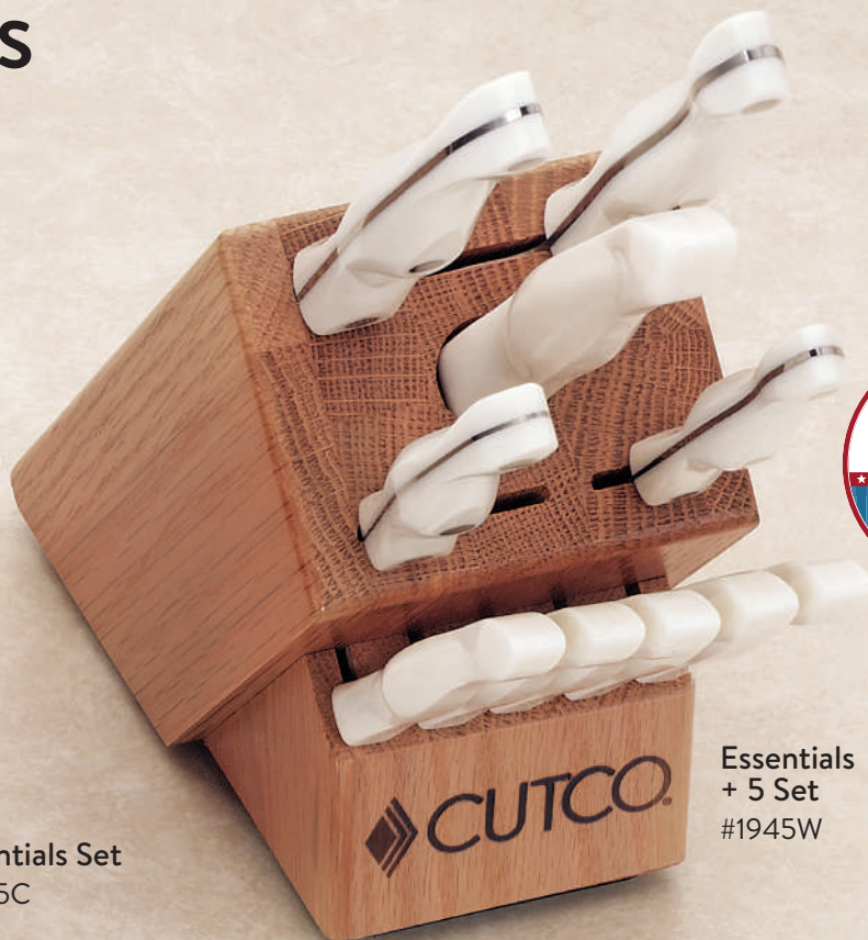
Essentials + 5 Set #1945W