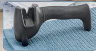
Knife Sharpener #84