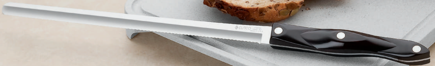
7-5/8" Petite Chef #1728C