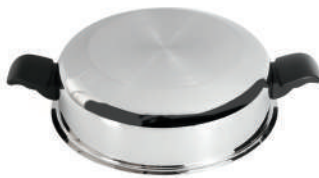
High Dome Cover - 6.3 Qt. Dutch Oven / Skillet #996