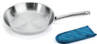
10" Gourmet Fry Pan #930 Handle Mitt #278