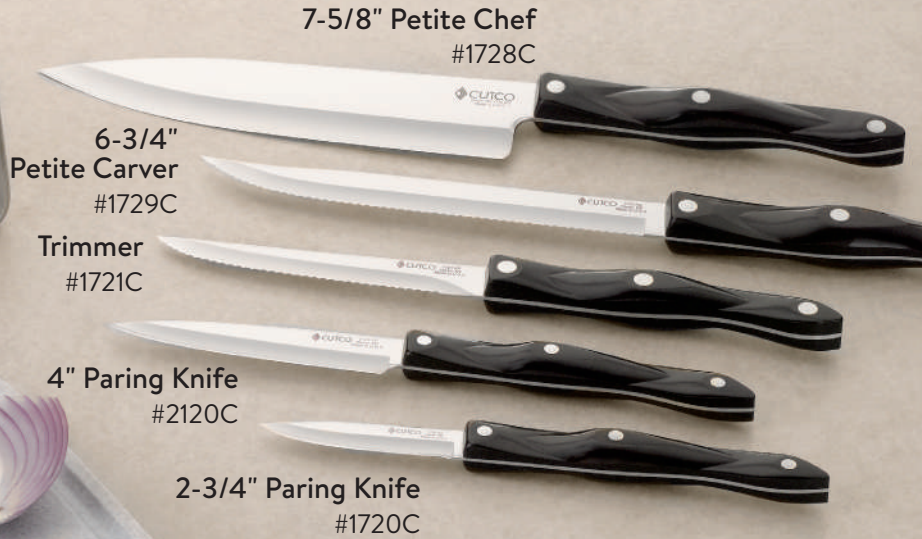
7-5/8" Petite Chef #1728C