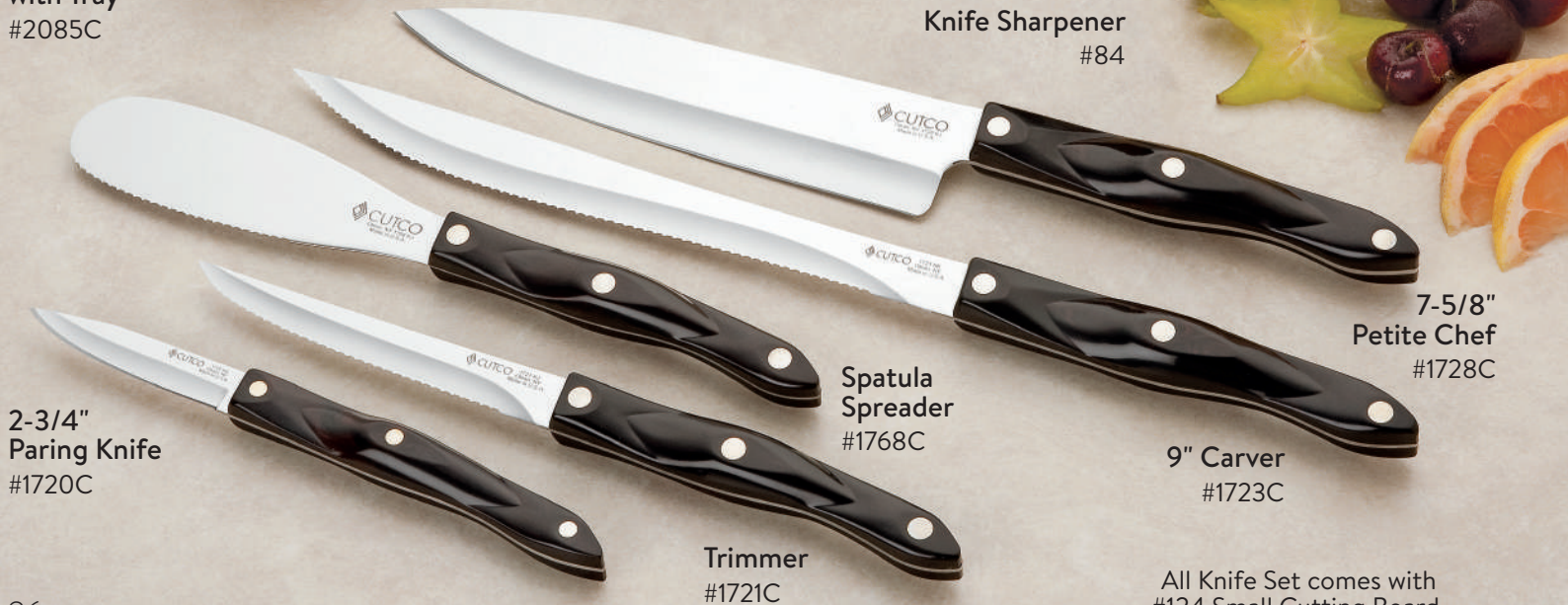
2-3/4" Paring Knife #1720C