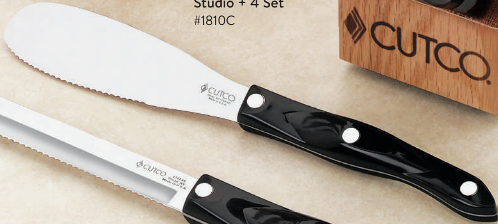
Studio + 4 Set #1810C