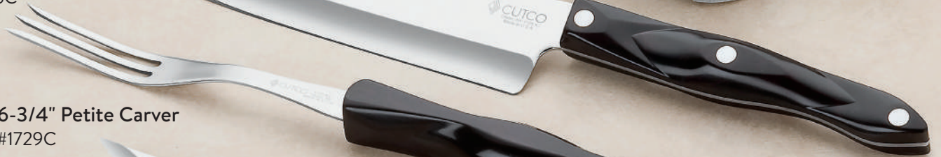
6-3/4" Petite Carver #1729C