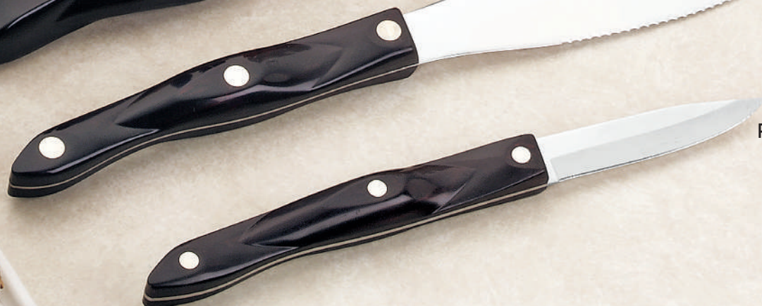
2-3/4" Paring Knife #1720C

Essentials Sets come with #124 Small Cutting Board.