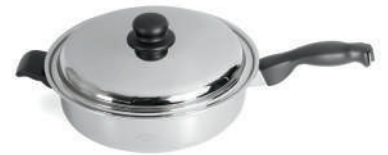
1 1/2" Skillet & Cover #990