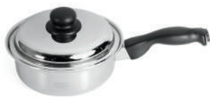
2 Qt. Sauce Pan & Cover #992