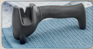
Knife Sharpener #84