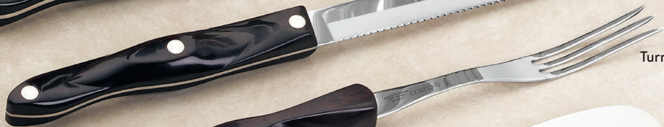
Turning Fork #1726C