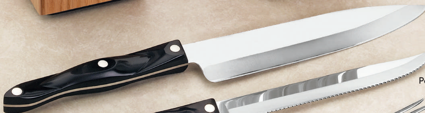
6-3/4" Petite Carver #1729C