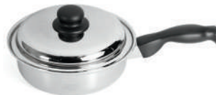
9" Utility Pan & Cover #998