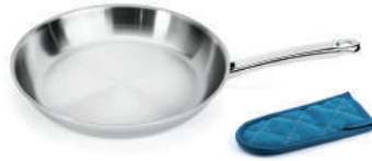
12" Gourmet Fry Pan #932 Handle Mitt #278