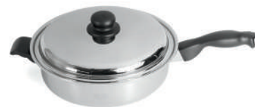
1 1/2" Skillet & Cover #990