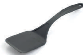
Free Turner with every order