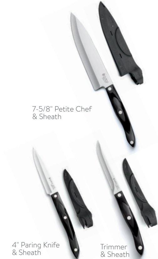
7-5/8" Petite Chef & Sheath