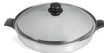
Wok & Cover #939