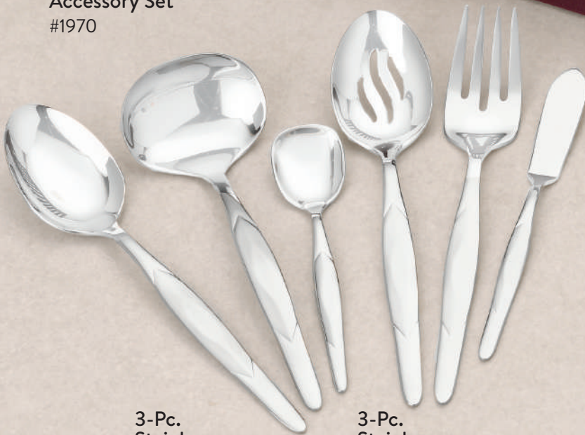
3-Pc. Stainless Hostess Set #1971