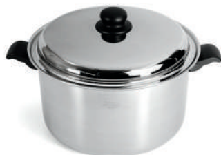
10 Qt. Stock Pot & Cover #936