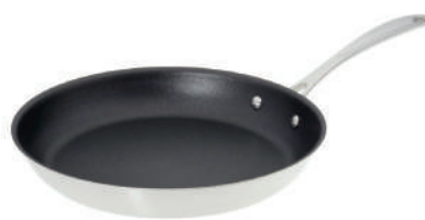
12" Nonstick Fry Pan #852