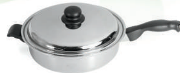
1 1/2" Skillet & Cover #990