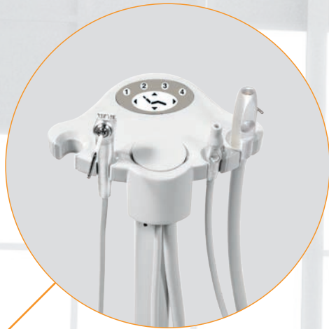
REAR PIVOT WITH TOUCHPAD, MODEL 1296

Double articulating headrest and thin back, narrows at the shoulders allowing maximum access to the patient.