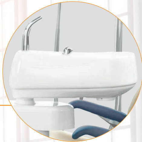
DELUXE SIDEBOX, MODEL 1577