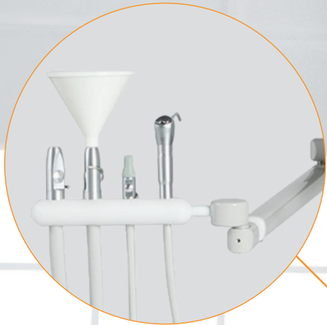
SIDEBOX INCLUDED WITH DELIVERY (SHOWN) REAR PIVOT, MODEL 1295

Available in fixed with sidebox or rear pivot for left/right access.