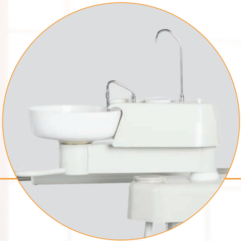
BASIC SIDEBOX, MODEL 1679 (SHOWN)