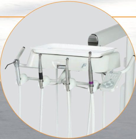
SIDEBOX, MODEL 4295SI (SHOWN) PIVOT, MODEL 4296PI

Rear beneath cabinet unit includes assistant's instrumentation complete with quad holder bar, air/water syringe, and autoclavable standard HVE and saliva ejector.