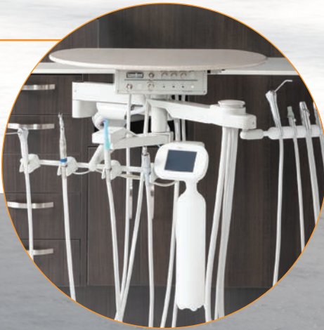
BENEATH CABINET DUO, MODEL 2184BC MODEL 2186BC (SHOWN)