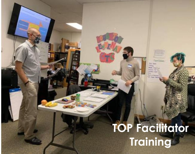
TOP Facilitator Training