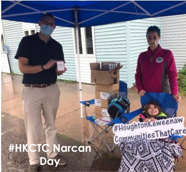
#HKCTC Narcan Day