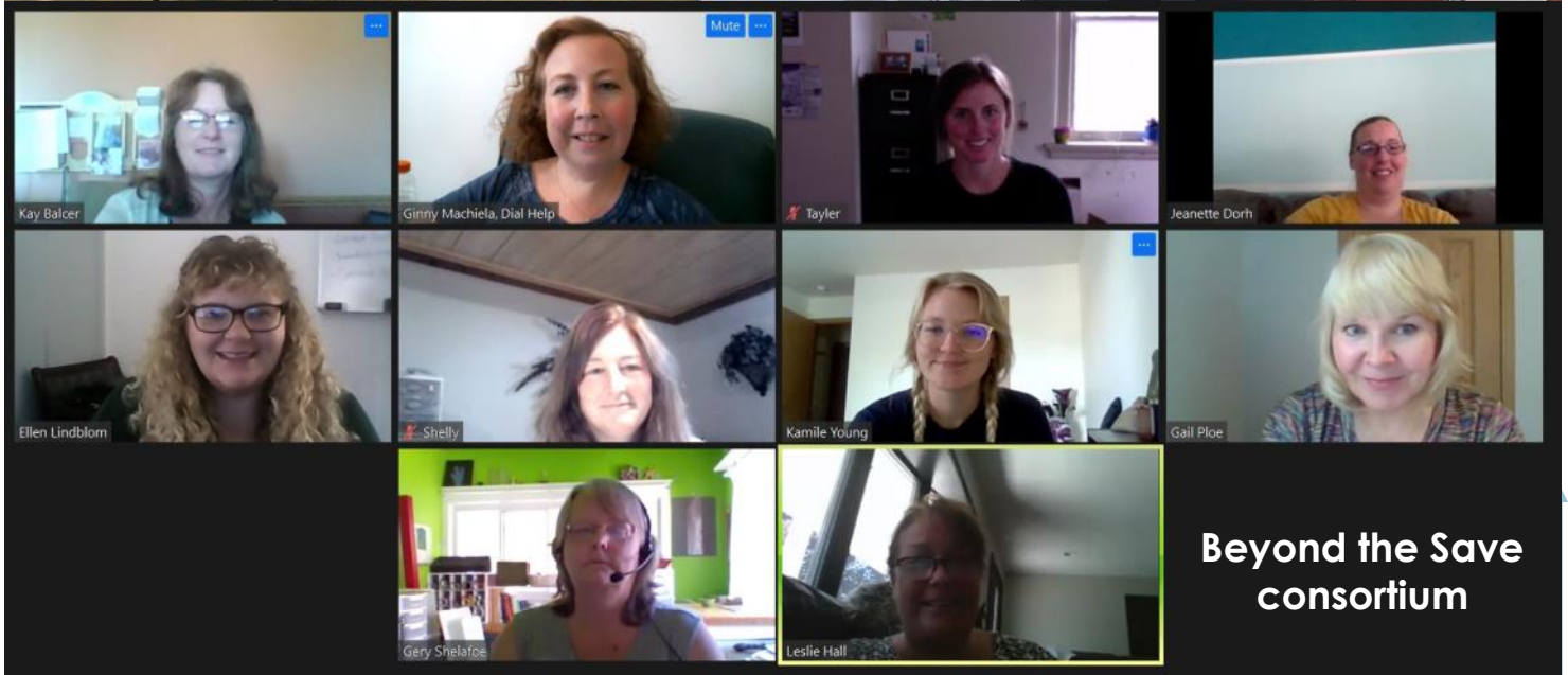
Beyond the Save consortium