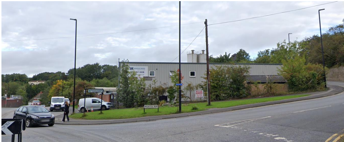
Fig 1 Approach from the east. Note existing buildings and note the trees and vegetation at risk along site boundary fence