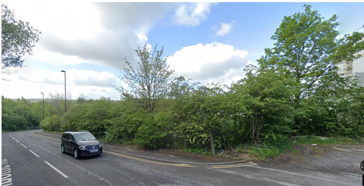
Fig 2 embankment vegetation to be removed at the lower end of Walbottle Road (southern end Tree Survey Group5)