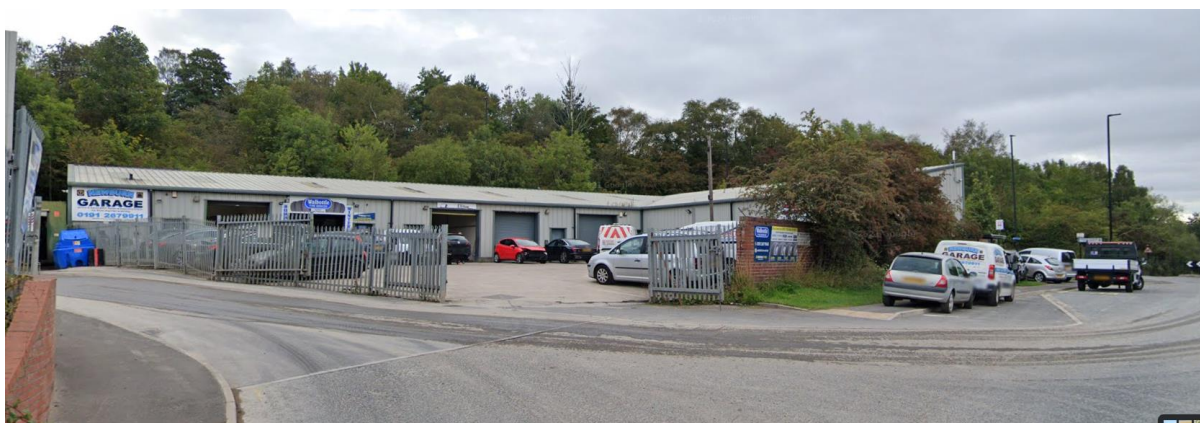
Fig 4 exposed entrance into the site – note the trees proposed for removal at rear of building (fig2) and vegetation at risk immediately outside the site, adjacent to brick wall (not surveyed in TreeSurvey right hand side of image)