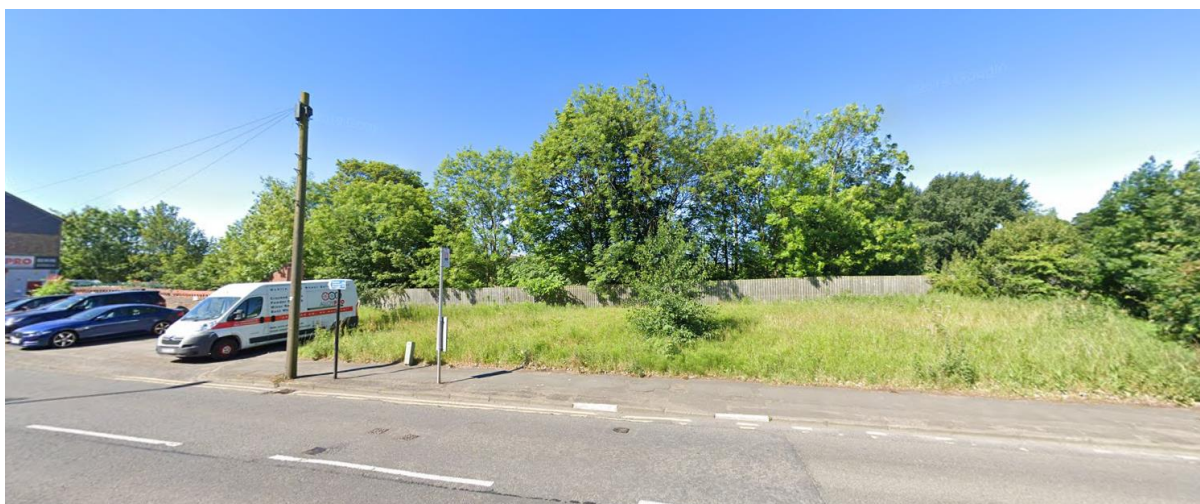
Fig 3 View from Hospital Lane – Trees and vegetation at risk from retaining wall excavations (Tree survey Group 4)