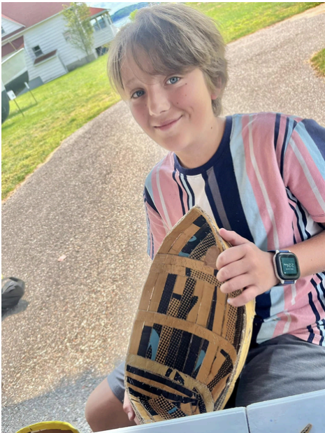
Art/History Workshops: X-Ray Lighthouse, right, and Adventures in Cardboard: Boat Building, left