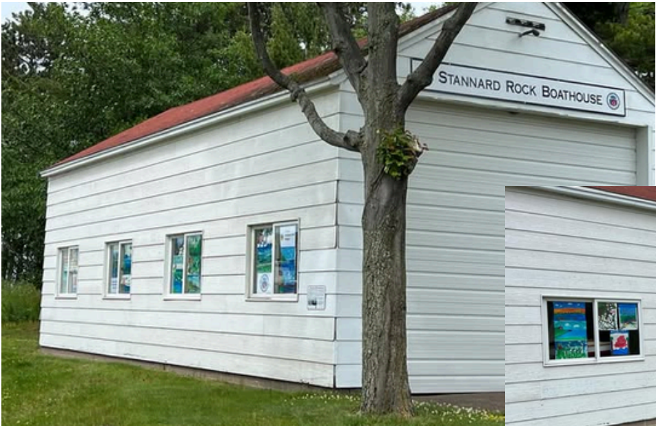
Plein Air Painting Artwork in the Stannard Rock Boathouse