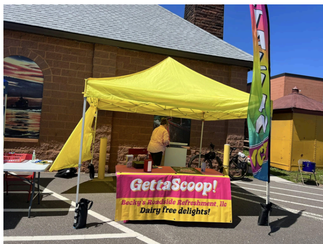
Booths from the 2024 Lake Superior Day. DNR's Sea Lamprey, left, and Becky's Roadside Refreshments, right