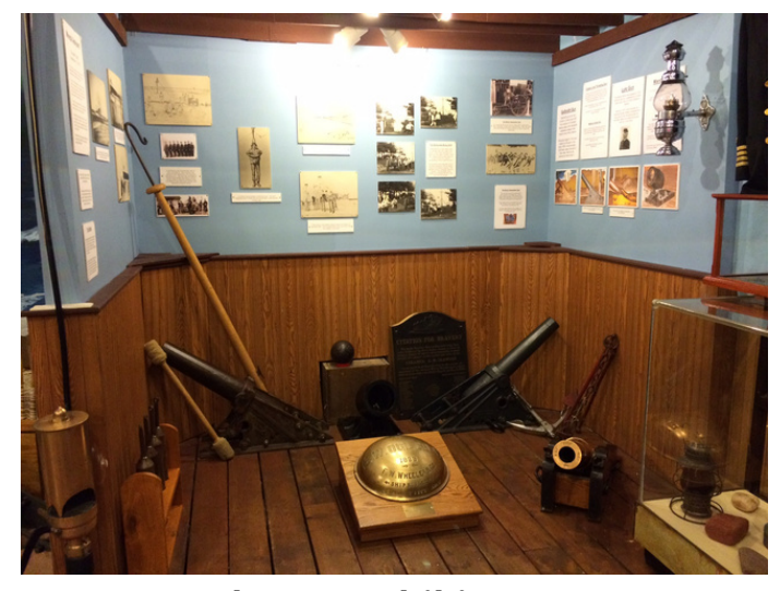
Lyle Gun Exhibit

Although we are still adapting to COVID regulations and making sure staff, volunteers, and guests all feel safe, we had a good year. We continue to increase our social media presence and develop a new fundraising events, such as the weekly Paranormal Lighthouse Tours. What is most important to us, however, is the outcome of participants learning and appreciating maritime history. We strive for our Museum guests to have a safe and enjoyable learning experience.