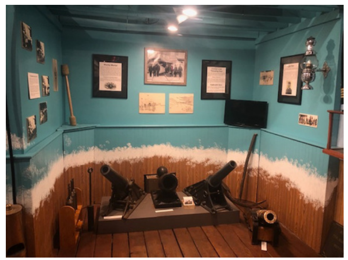
Lyle Gun Exhibit Update 2021