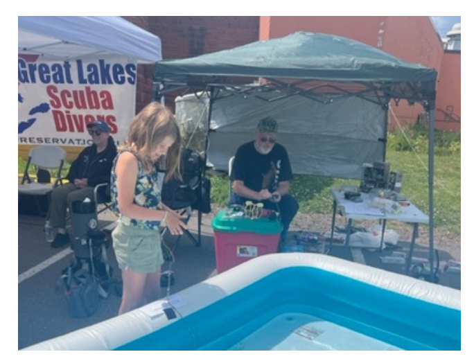
Booths from the 2023 Lake Superior Day. DNR's Sea Lamprey, left, and Lake Superior Science and Education Program, right

We opened late one Saturday in July and took our staff and volunteers on a field trip to visit our neighbors, Coast Guard Station Marquette. We spent a fun morning learning about what they do and how they do it.