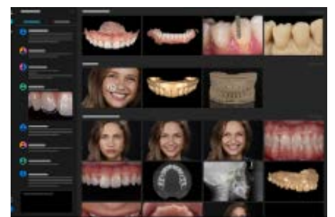
Collaborate with team members in a single click