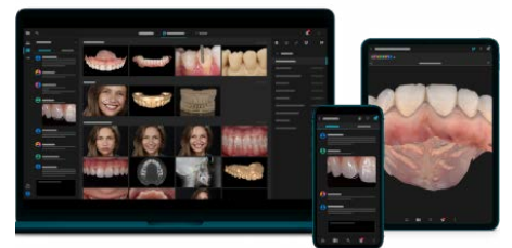
Secure cloud storage