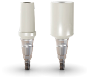
GM Pro Peek Abutment 1