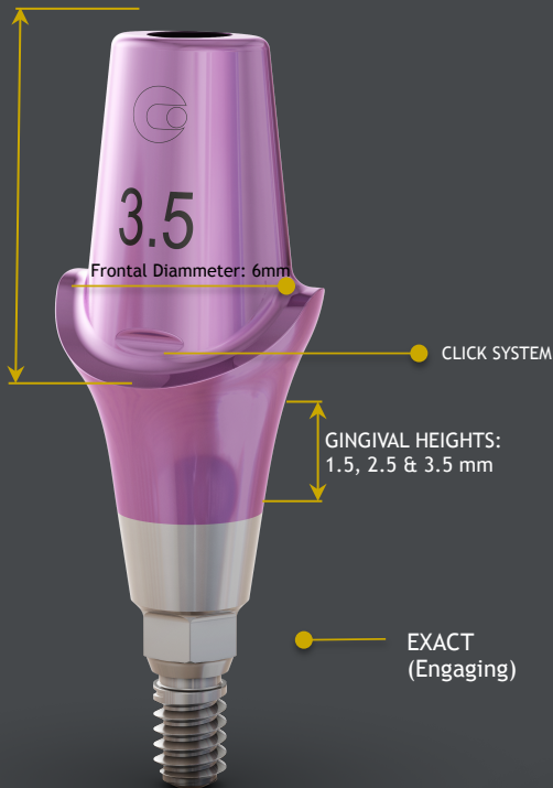
GM ANATOMICAL ABUTMENT