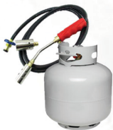
PROPANE TANK AND TORCH *NEEDED IN COLDER WEATHER